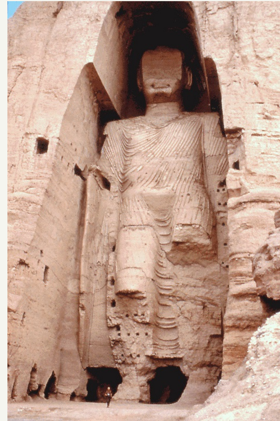
"Taller Buddha of Bamiyan"

About 20 years ago, in March 2001, the Bamiyan Buddhas were destroyed in Afghanistan.