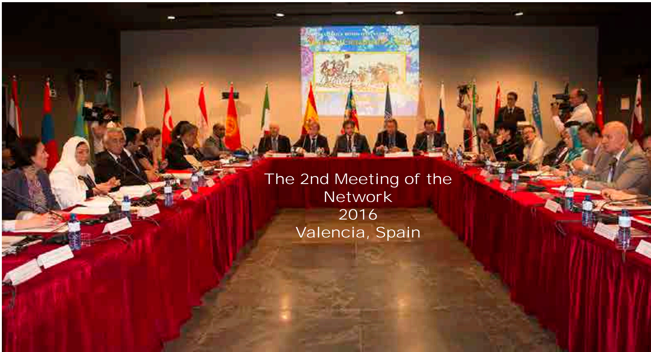
The 2nd Meeting of the Network 2016 Valencia, Spain