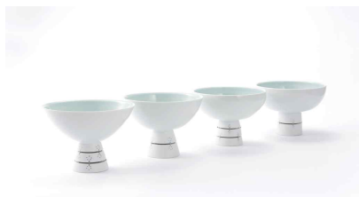
High Heel Bowl