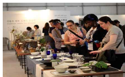
Icheon Ceramic Award