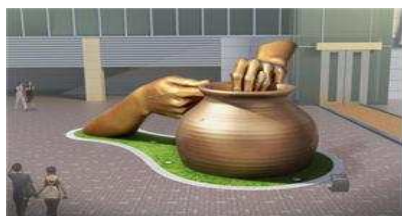
Sindundoyechon Station : The Spirit of a Thousand Years

citizens unifying, and the sculpture title 'A Brilliant Leap' located in Bubal Station represents the development of technology-intensive high-tech industry symbolizing the semiconductor cube and circuit.