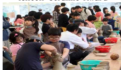
Experiencing Pottery Wheel

Icheon Ceramics Festival is sponsored by the Korea Ceramic Foundation, Korea Institute of Ceramic Engineering and Technology, Korea Tourism Organization, and major companies in Icheon, which make it a festival of coexistence that can enhance the quality of the event as well as the global company brand. Additionally, the