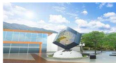
Bubal Station : A Brilliant Leap