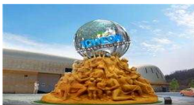
Icheon Station : Icheon of Hope