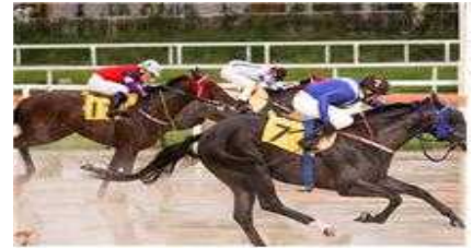
Racehorse 'Icheon Rice'

repeatedly, and therefore, we expect that it will be an opportunity to effectively promote the image of Icheon being a Creative City to visitors from all across the country.