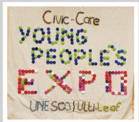
Official Artistic Banner on the Civic-Care made by Project Team