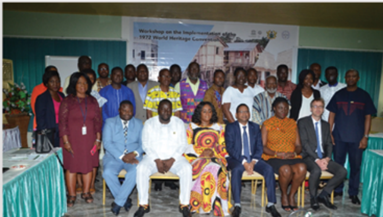
Participants at the workshop – seated in the Middle are the Minister for Tourism Arts and Culture and the UNESCO Representative

Other recommendations made related to establishing an effective and conducive environment for managing heritage in Ghana and these included the need to undertake organisational review supported by change management approach, developing a Masterplan for Heritage Management, developing a Resource Mobilisation strategy and related Implementation Plan and prioritising Documentation and Records Management as a decision-making tool. In the overall, the workshop recommended continued capacity building for Ghana in the implementation of the Convention given the young generation of practitioners being brought on board by GMMB.