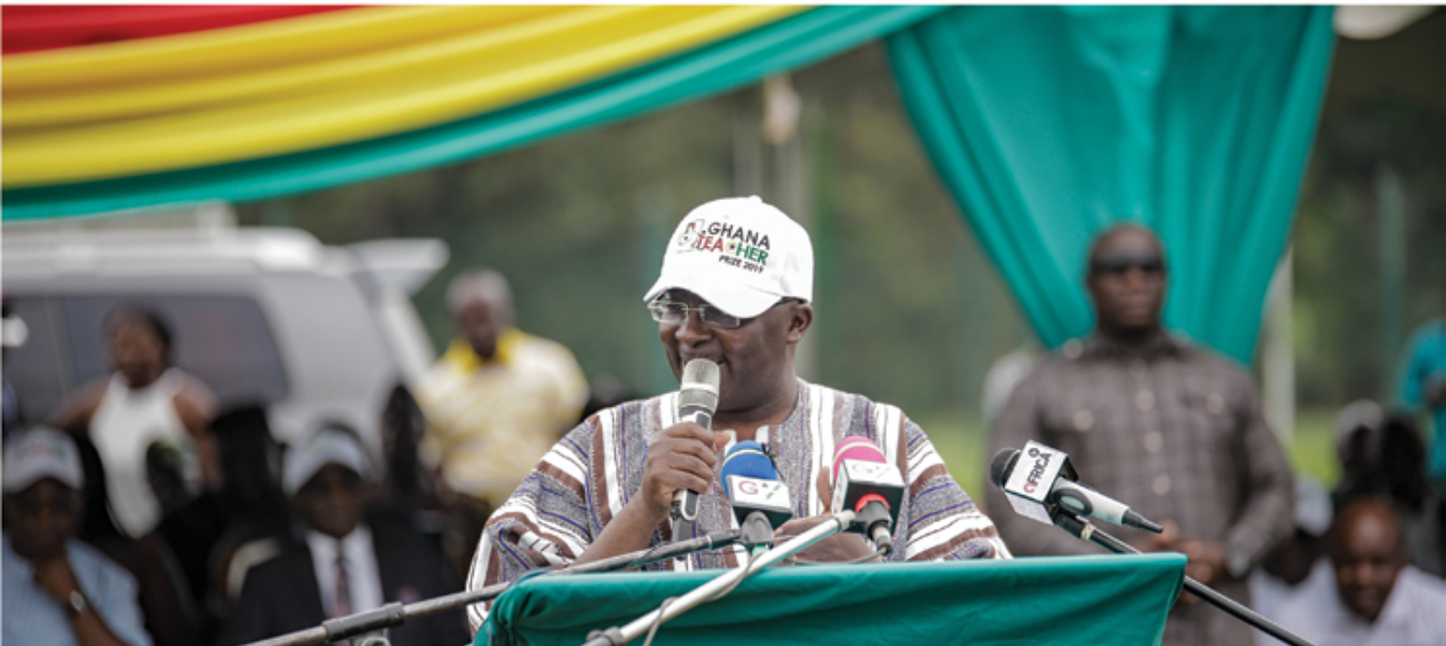
Vice President Dr Mahamudu Bawumia

e) The 2019 World Teachers Day Celebration: Known in Ghana as the Ghana Teacher Prize, the World Teachers Day celebration event is used by the Government to recognize and celebrate the outstanding role of teachers in promoting education across the country. The event is aligned with the Africa and the Global Teacher Prize thereby making the winners to automatically qualify for the Africa and Global Teacher competition. UNESCO provided financial and technical support to the Government to celebrate the 2019 edition.