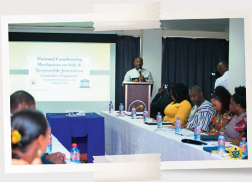
The Minister of Information Mr. Kojo Opong Nkrumah addressing the opening ceremony