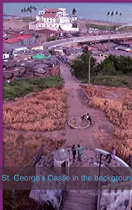
St. George's Castle in the background