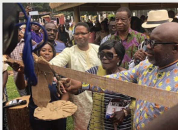
UNESCO Representative with other dignitaries officially opening the library