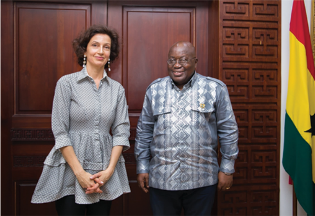
DG with the President of the Republic of Ghana

2019 was characterised by a strengthening of cooperation between Ghana and UNESCO. A number of significant events hosted by our office, and we were notably honoured to receive our Director-General, Ms Audrey Azoulay. She held bilateral discussions with the President of Ghana, Nana Addo Danquah Akuffo-Addo, on the strengthening of the bonds of cooperation between Ghana and UNESCO, as well as holding working meetings with Ministers in the Organization's areas of operation to discuss projects, vision and reinforced collaboration. She also took part in the regional launch of the O3 programme « Our Rights, Our Lives, Our Future ». The end of the year culminated with the election of Ghana for a 4 year term at the Executive Board of UNESCO and in two intergovernmental committees namely IFAP (Information for All programme) and MAB (Man and Biosphere).