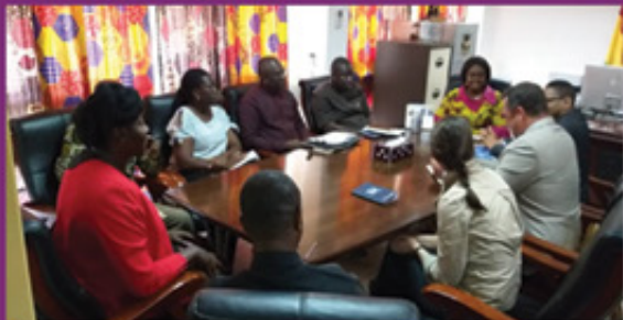
Planning meeting on September 20 2019 at the UNESCO Office to look at the implementation

Ghana invited a joint WHC-ICCROM-ICOMOS Advisory Mission to review and assess a tourism development project in the vicinity of the Elmina Castle and Fort Saint George in Elmina and the development and restoration projects at Fort Amsterdam in Abandze, two components of the World Heritage property.