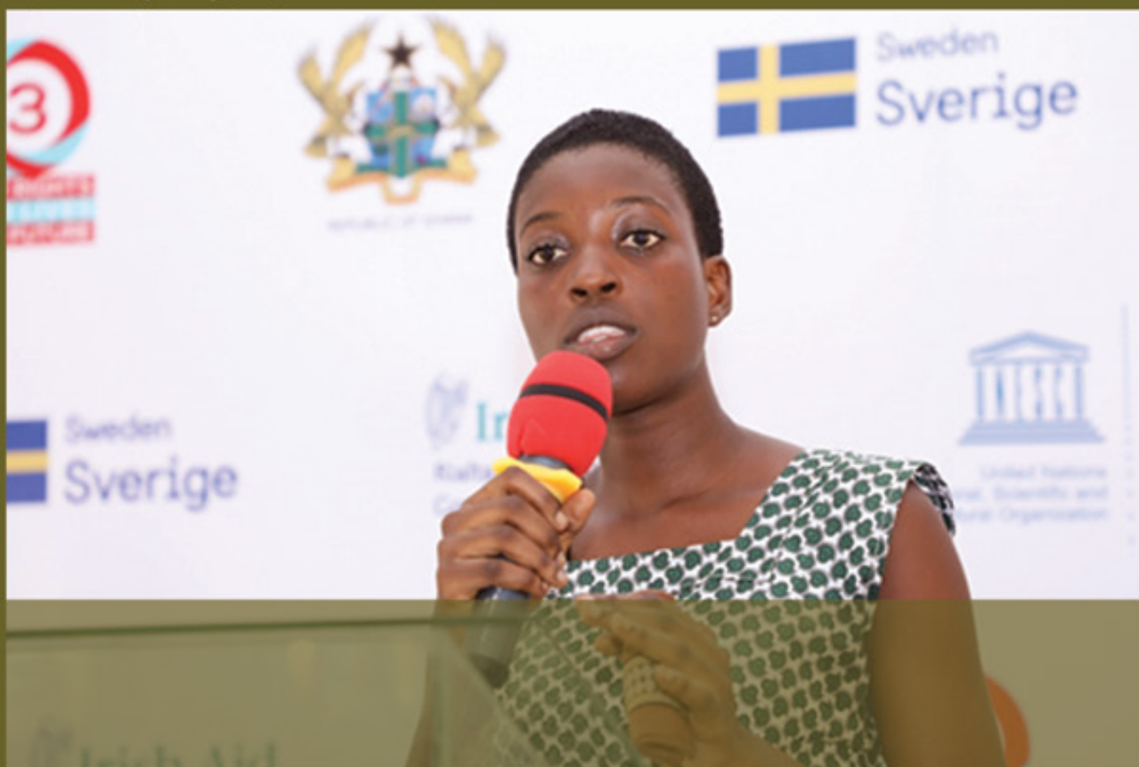
A Student of Accra Girls Senior High School asking question during the O3 Launch

b) Gender in Education: Since 2016, the UNESCO Office in Accra and its partners (including the Ministry of Education and Ghana National Commission for UNESCO) have been implementing a project under the UNESCO-HNA Partnership for Girls' and Women's Education, funded by the HNA Group and Hainan Cihang Foundation. The focus of the project was twofold. Firstly, it seeks to enhance the capacity of the Girls' Education Unit of the Ghana Education Service to effectively deliver on its mandate, and secondly, to increase girls' participation in science-related subjects at the secondary school level.