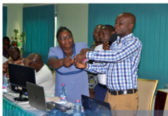
Biology group demonstrate their working lung model using plastic bottle

The participants developed a communiqué at the end of the workshop on how they intend to deepen the study of STEM in the country. The communiqué is to be shared with the Ministry of Education.