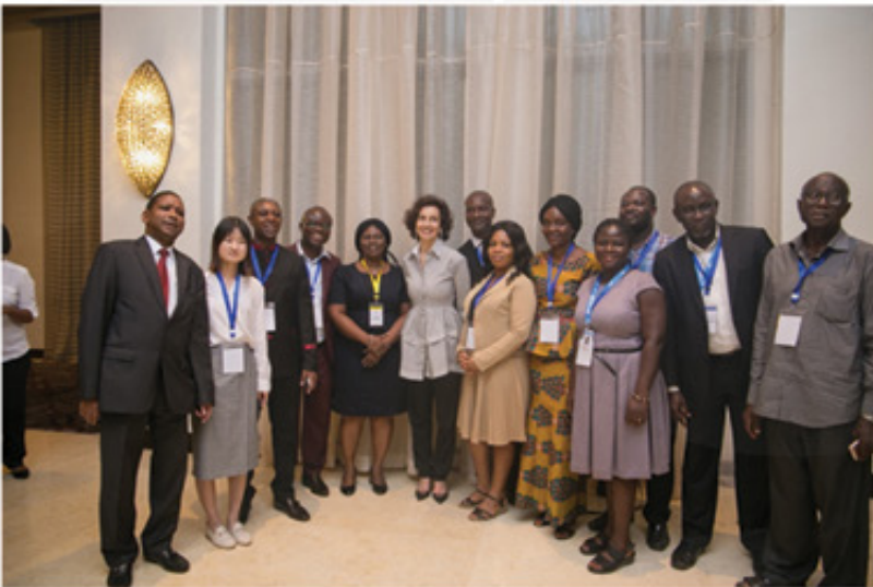
Director General with UNESCO Accra Staff