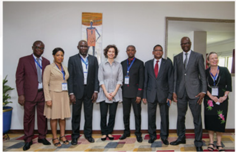
Director General with UNESCO Accra Staff