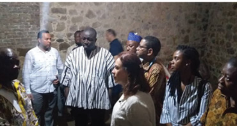
H.E. Ms. Maria Fernanda Espinosa in a dungeon at the Cape Coast Castle with the Ag. GMMB Director, Deputy Minister for Tourism, Arts and Culture, UNESCO Representative and UN Resident Coordinator

However, like other forms of development, tourism can also cause its share of problems, such as social dislocation, loss of cultural heritage, economic dependence and ecological degradation. Learning about the impacts of tourism has led many people to seek more responsible holidays. These include various forms of alternative or sustainable tourism such as: 'nature-based tourism', 'ecotourism' and 'cultural tourism'.