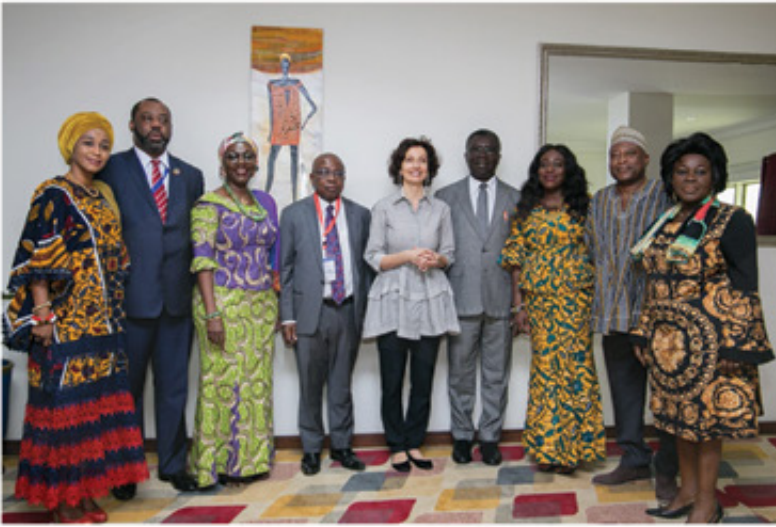
Director General with Ghana's Ministers responsible for UNESCO's areas of Competence