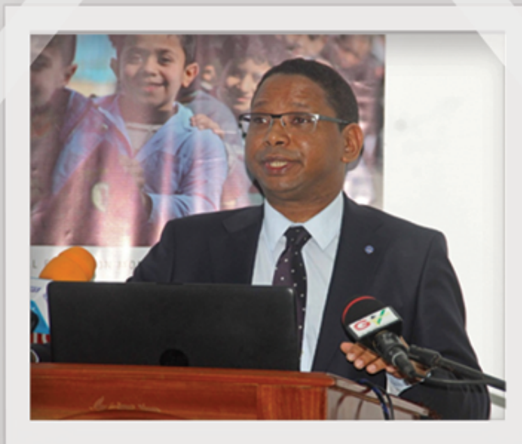
Mr Abdourahamane Diallo (UNESCO Representative to Ghana)

a) SDG 4 Target 5 Workshop in Accra: The UNESCO Internal Oversight Service (IOS) Evaluation Office in conjunction with UNESCO Accra organized a day's workshop in Accra to review and validate a synthesis report on Ghana's progress in the achieving SDG 4.5. The initiative ' Making evaluation work for SDG 4 Target 5 ' is a response to the absence of a broadly accepted evaluation framework that informs the Member States why they stand where they stand and how they can accelerate or consolidate their progress towards the SDGs, including SDG 4.5. This SDG target calls upon Member States to: By 2030, eliminate gender disparities in education and ensure equal access to all levels of education and vocational training for the vulnerable, including persons with disabilities, indigenous peoples, and children in vulnerable situations.