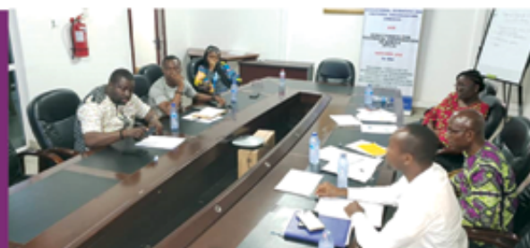
Planning meeting on September 20 2019 at the UNESCO Office to look at the implementation

It will also contribute to the Preparation of a management plan for the Forts and Castles of Ghana, which will be funded by an International Assistance under the World Heritage Fund (approved in 2018)