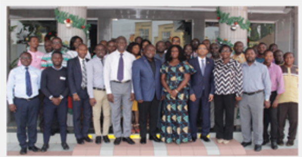
Group photograph of the workshop participants

In relation to this, the UNESCO Accra Office in collaboration with the Council for Scientific and Industrial Research - Science and Technology Policy Research Institute (CSRI-STEPRI) and the Ministry of Environment, Science, Technology and Innovation (MESTI), organized a stakeholder consultation workshop on 19 December 2019 to discuss the preparation of a workplan towards the development of a roadmap for the STI for SDG's initiative. The workshop provided the opportunity for all the relevant stakeholders to contribute to the various tasks under the work plan and timelines. Participants also identified the SDGs that Ghana could prioritize for the initiative and an outline for the roadmap.