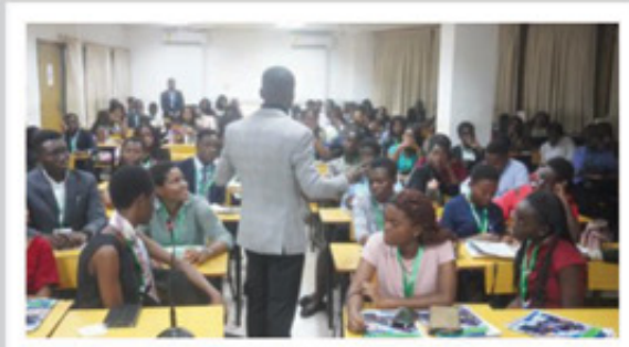
Hands-on Civic-Skills Engagement with students and community youth

Findings from this action-research informed the design and implementation of the "Civic-Care Project. And in October, 2019, the current project emerged as the best proposal from the call/contest for the Anglophone West Africa countries. UNESCO therefore provided financial support to implement the project from November, 2019 to April, 2020 in Ghana.