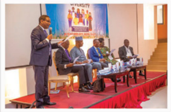
Panel during the Opening Ceremony