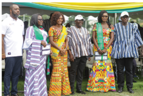
Winners with Vice President and senior government officials

The event under the theme- “the young teacher: the future of the profession” was with a two-day symposium (funded by the Norwegian Teacher Initiative/Ghana Teacher Task Force) on 3rd & 4th October in Kumasi. The grand durbar was graced by the Vice President of the Republic and some senior government officials. In his speech, the Vice President Dr Mahamudu Bawumia praised the Norwegian Teacher Initiative (NTI) for supporting the government through the Ghana Teacher Task Force to develop a comprehensive National Teacher Policy.