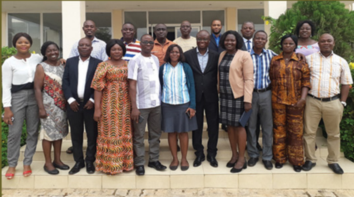
Group picture of the participants and UNESCO Education Specialist after the opening session

c) Training programme for Science, Technology, Mathematics and Innovations Education (STMIE) Coordinators : As part of deepening the impact of the UNESCO-HNA Partnership for Girls and Women's Education, UNESCO Accra supported the Greater Accra Regional Education Directorate to organized a 5-day Gender Responsive training workshop for Science, Technology, Mathematics and Innovations Education (STMIE) Coordinators in the Greater Accra Region. At the training programme, the District STEMIE Coordinators were introduce current STEM pedagogies and curriculum ideas to support girls in the fields of STEM; technology-based opportunities for gender responsive course development and delivery, and the new Basic school curriculum and equip them with 21st century leadership skills. In all, 20 participants (6 women/14 men) were equipped with of new pedagogical skills to enable them to their work better.