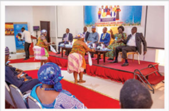
Cultural display during the Opening