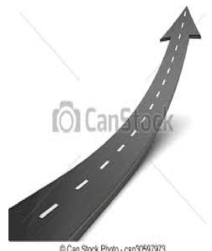
Can Stock Photo - csp30597973