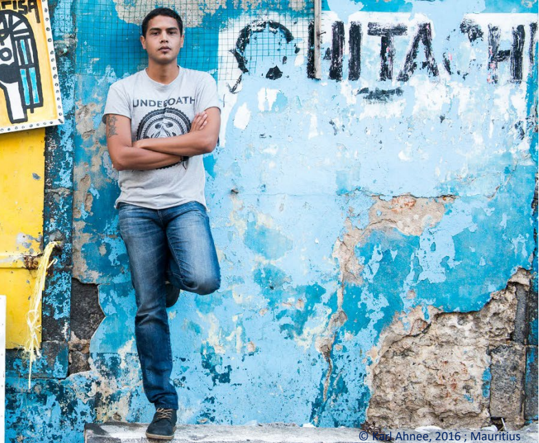
© Karl Ahnee, 2016 ; Mauritius