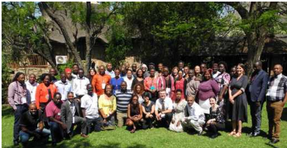
Group photo of the participants during the Pretoria workshop.

The regional training of trainers on participatory policy monitoring fostered peer-to-peer cooperation mechanisms, promoted mutual learning and expanded South-South cooperation. The results of the three training of trainers have been very positive, countries drawing on the examples of others and building communities of practice at regional level. The networking opportunities enabled by the trainings between UNESCO Field Offices, members of the Expert Facility, national counterparts and civil society organisations greatly facilitated the implementation of technical assistance. Support for the participatory elaboration of periodic reports was thus possible in ten additional countries, at the initiative of Field Offices or through self-financing schemes.