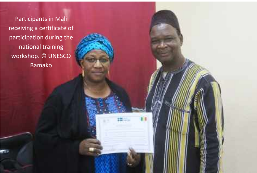
Participants in Mali receiving a certificate of participation during the national training workshop.

The project has a large range of direct beneficiaries including: