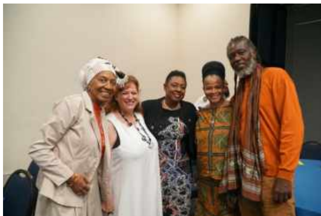
Avril Joffe, International expert of UNESCO, together with participants and the Minister of Culture of Jamaica during the multi-stakeholder consultation.

Political commitment from national counterparts has also been instrumental in ensuring the achievement of the project outcomes, creating a snowballing effect. For instance, in Uganda , the project has so far enhanced the government's interest to increase the budget for the cultural and creative industries. In Peru , the participatory elaboration of the QPR has led to the identification of a series of policy priorities, including the reinforcement of cultural governance at the local level and the improvement of the status of the artist, which are already being addressed through the design of concrete programmes and the updating of relevant policies.