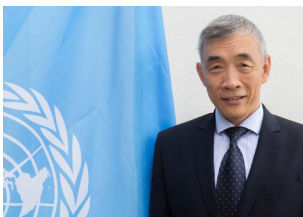
Xing Qu DEPUTY DIRECTOR-GENERAL

To respond to the challenges faced today and position UNESCO as an institution for the 21st century, our Organization needs to embark on a strategic transformation with clear objectives. We need to reposition the programmes at the heart of our Organization and enhance our role as a laboratory of ideas. We also need to open up UNESCO and further strengthen the overall efficiency of our operations and modernize the way we operate internally.