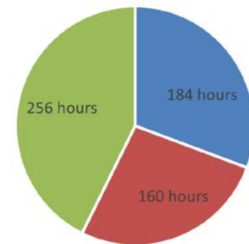
CG workload distribution by activity type

■ Instruction hours ■ Individual Study ■ Practical application