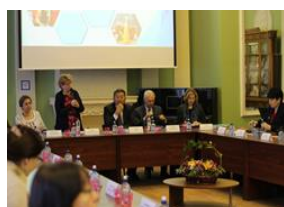
International Round Table: «Problems and Prospects of Arts Education in the Context of Contemporary Culture»

Anniversary of Taras Shevchenko 1814 - 2014