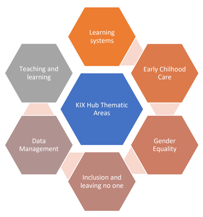
Figure 1: KIX Hub Thematic Areas

The Anglophone Africa Regional KIX Hub provides a timely opportunity to catalyse the provision of quality education through facilitating evidence-based developments in policy and practice, and through identifying and contextualizing evidence in education agendas unique to the region. Given that the Anglophone region has a number of countries affected by conflicts, other context specific education innovations deemed pertinent to the DCPs to foster inclusivity, such as education for crisis-affected and displaced populations, including education for children on the move, will also be included with the overall goal to contribute to SDG 4 aspirations and the realization of GPE's strategy.