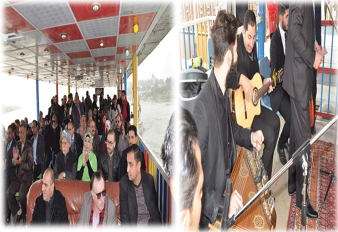
The Literary Boat