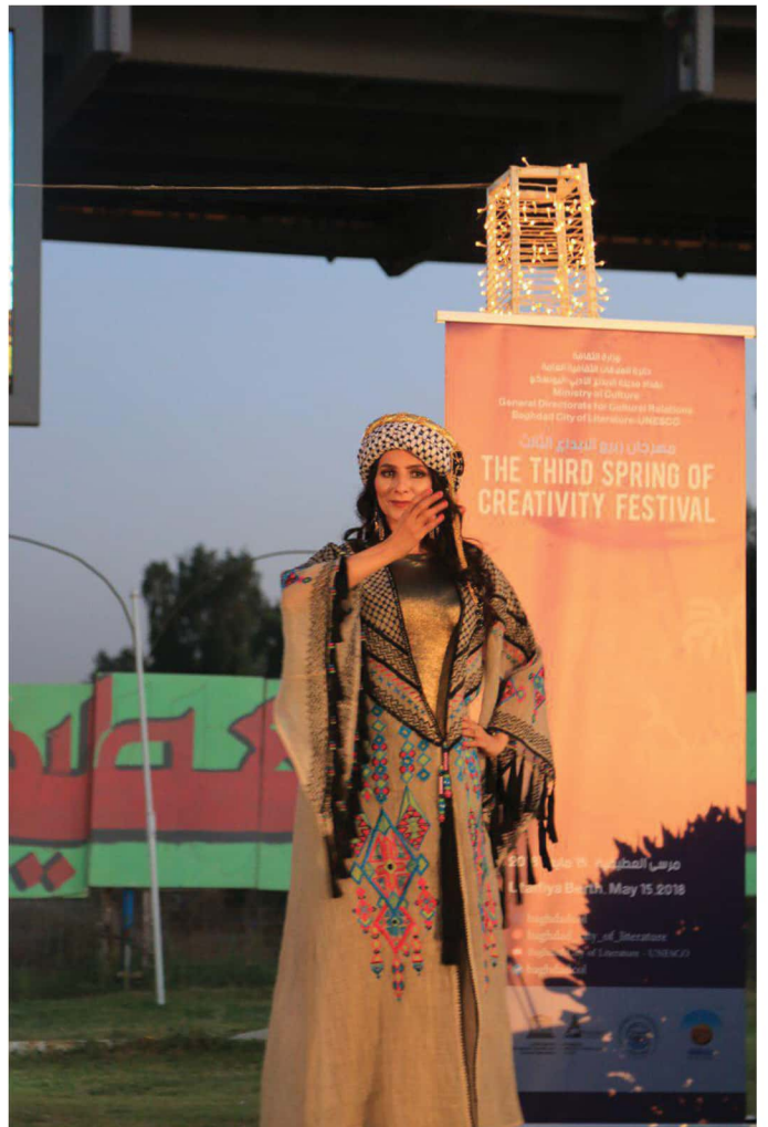
• Spring of Creativity Festival