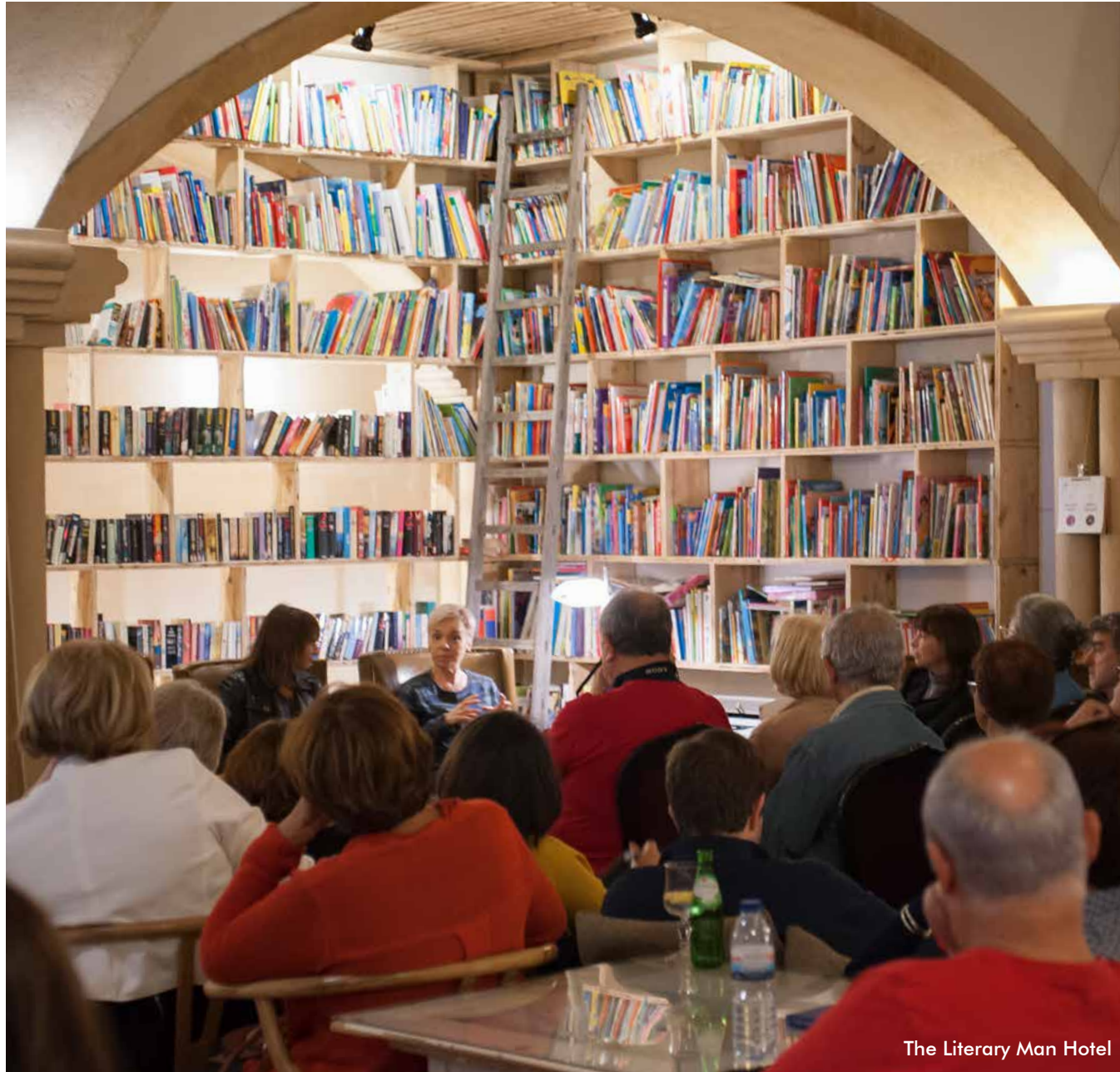
The Literary Man Hotel