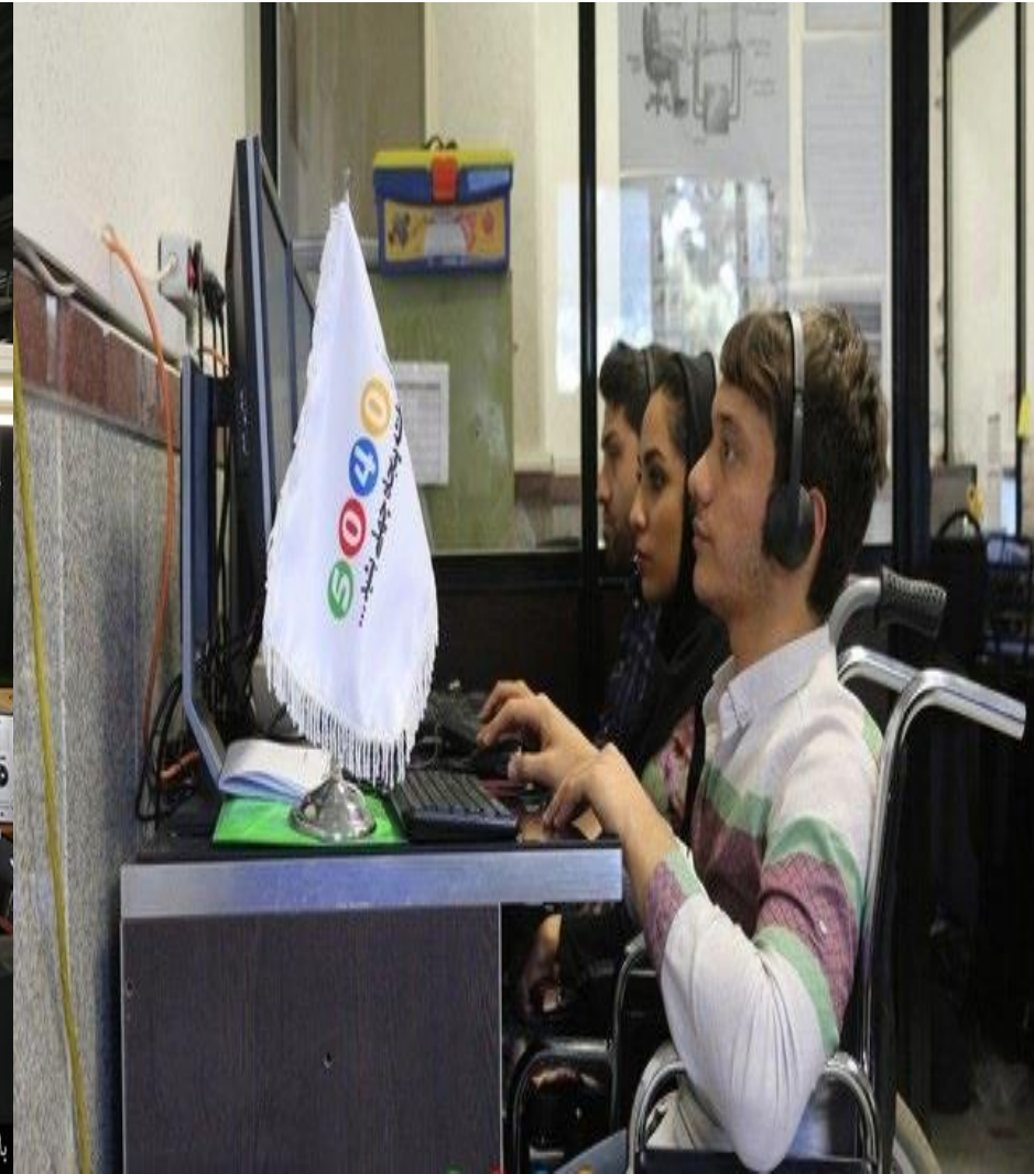
باشگاه خبرنگاران پویا