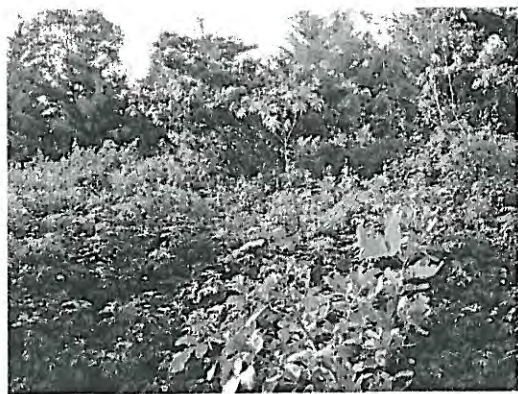
The density of the bushes from the roadside.