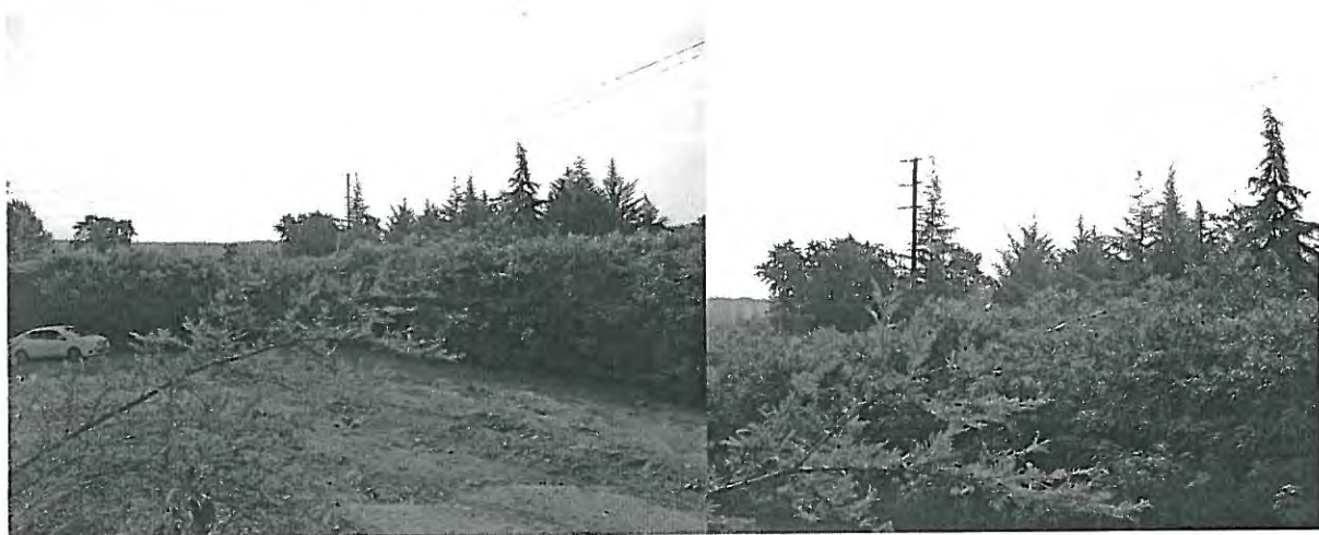
The site where the remains of the late Nyaruri are said to have been found marked by the electricity pole or immediately as you turn as in first picture.