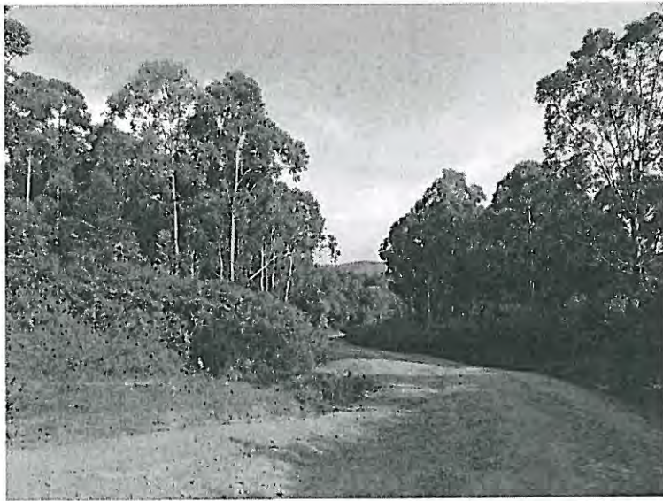
General view of the forest.