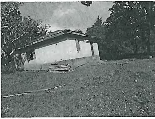
Forest guards' office about 200 metres from the site.