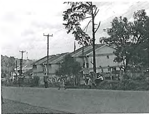
Part of the Nyamira police housing project alleged to have been connected to the journalist's murder.