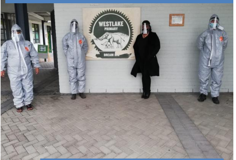
1,5 M DISTANCE