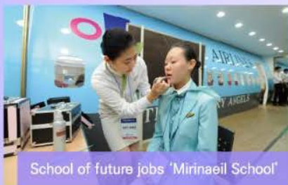
School of future jobs 'Mirinaeil School'