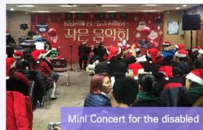
Mini Concert for the disabled