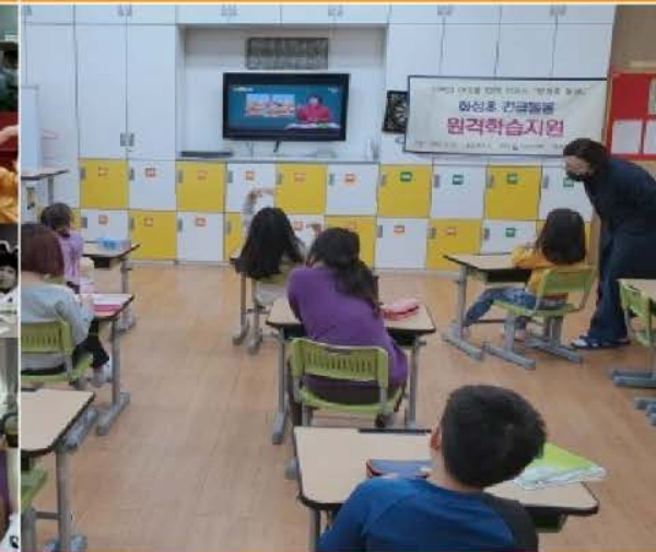
Dispatched instructors to help with online learning