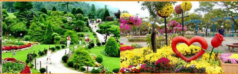
Exhibition of Gardens (2022)