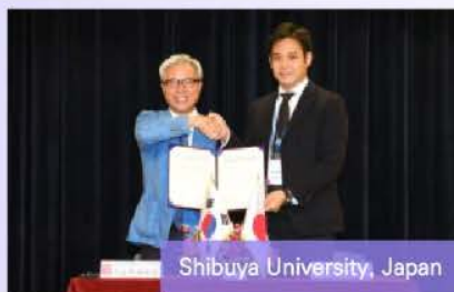
Shibuya University, Japan