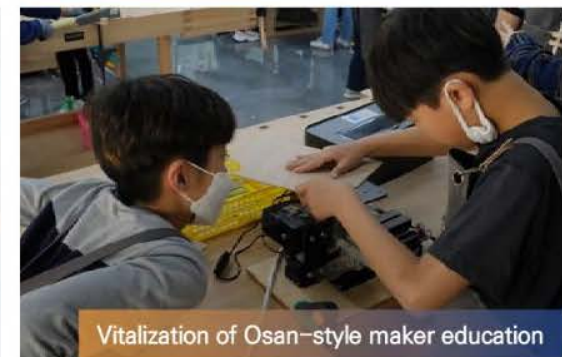
Vitalization of Osan-style maker education