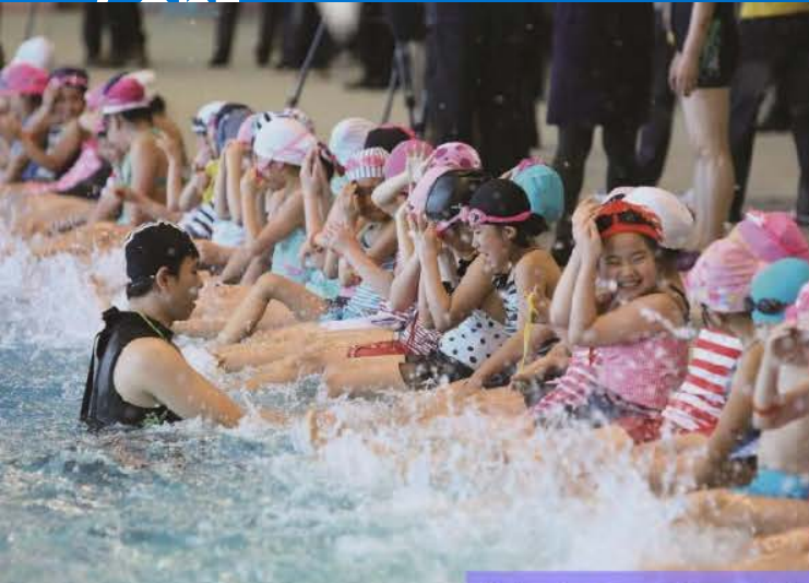
Swimming lessons for survival