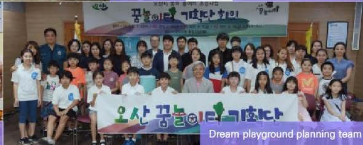
Dream playground planning team