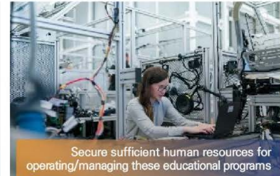
Secure sufficient human resources for operating/managing these educational programs