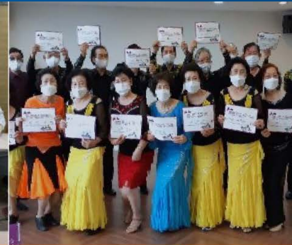
Lifelong Learning Neighborhood Festivals