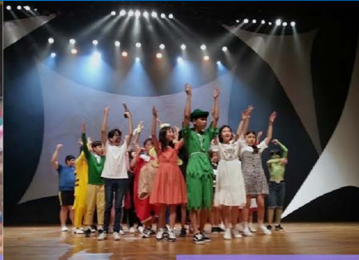
One musical performance per student