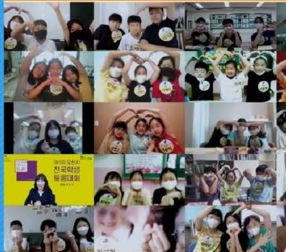
Online Debate Competition