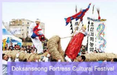
Doksanseong Fortress Cultural Festival