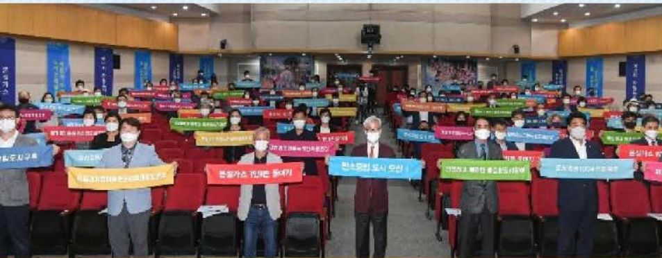
Declaration of net zero goal