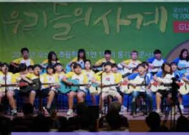
One musical instrument per youth