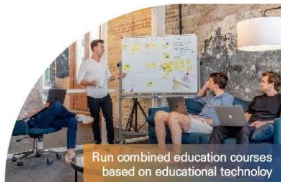
Run combined education courses based on educational technology