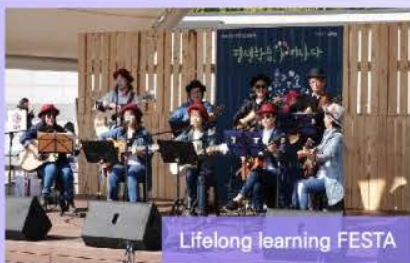
Lifelong learning FESTA