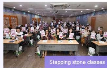
Stepping stone classes