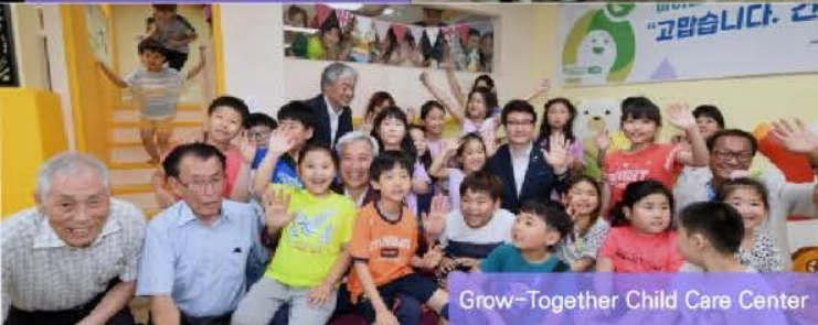
Grow-Together Child Care Center