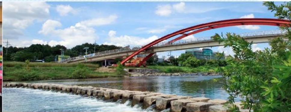
Smart Eco Osancheon River where the otters returned