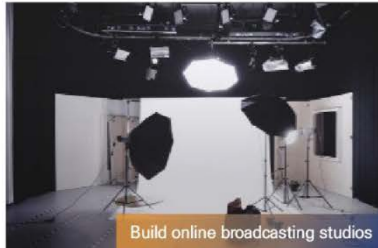
Build online broadcasting studios