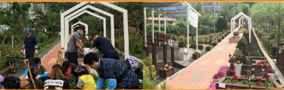
Resident-developed village gardens