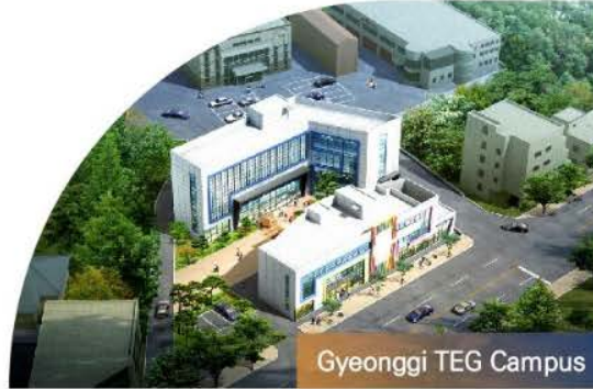
Gyeonggi TEG Campus