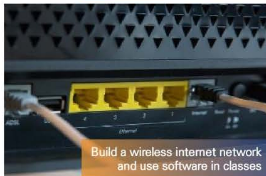
Build a wireless internet network and use software in classes