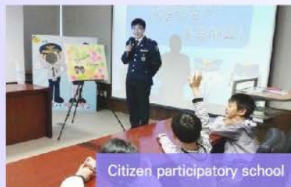
Citizen participatory school