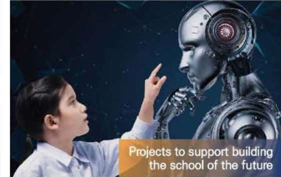
Projects to support building the school of the future