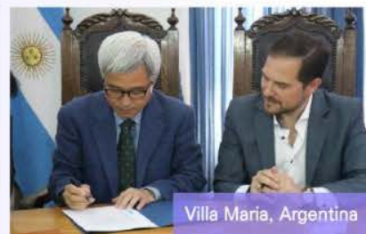
Villa Maria, Argentina