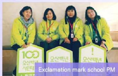
Exclamation mark school PM