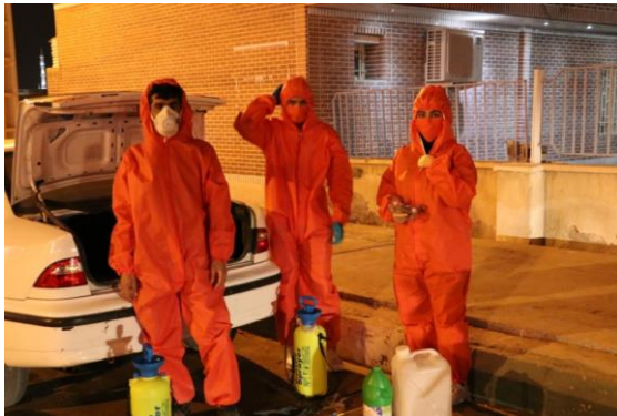
Produce masks and scrubs