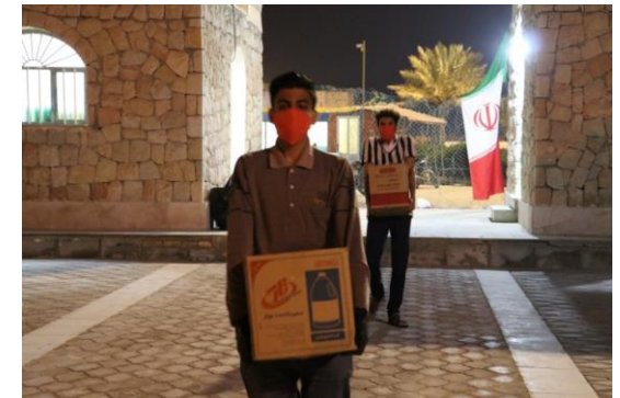
Take care of the vulnerable