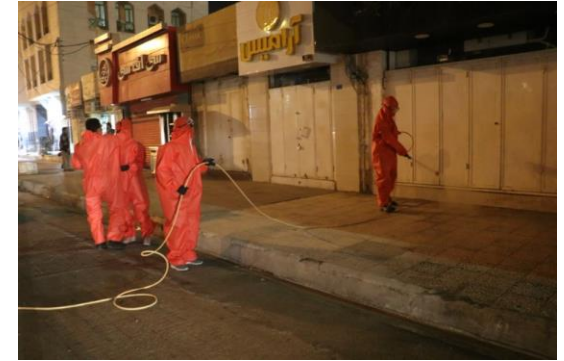
Help disinfect surfaces