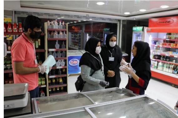
In-person training of people