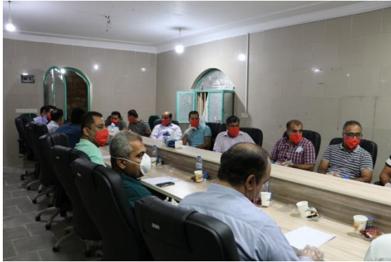
Collect social donors