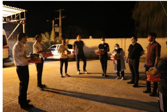
Provide required facilities for the clinics and hospitals