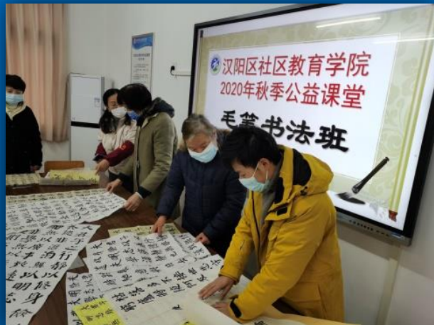
Jiangcheng Reading Festival