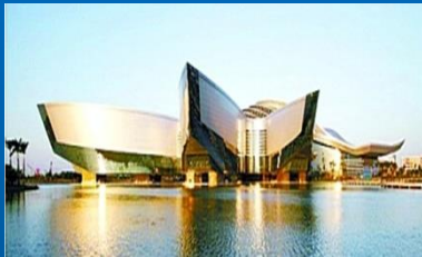
City of design originalities