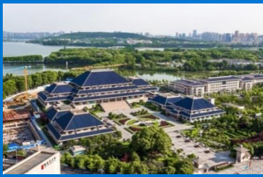
City of museums

It has initiated the construction of a city of reading, a city of museums, a city of art, a city of design originalities and a city of universities, which are five aspects to enhance the overall urban cultural atmosphere, make culture an important carrier to increase urban civilization and taste, and improve continuously the urban quality and image through spiritual guidance and the cultured people.