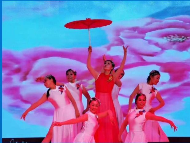
Public Lifelong Learning Week

The thematic activity of “Scholarly Wuhan · Public Reading Month” has been organized. Reading activities such as “Jiangcheng Reading Festival”, “Wuhan Literature Week”, “Writers into Communities” and “Wuhan Book Fair” have been carried out to attract the active participation of the public; a series of expert forums have been held for citizens; “online reading area” and activities such as “cloud live stream” and “cloud reading” have been planned, and free electronic reading packages have been distributed to citizens, to meet their needs of participating in learning and interactions. Meanwhile, to help special people to participate in learning, the “passing the flame” intelligent listening plan has been formulated to provide a pleasant reading experience for readers with visual impairment.