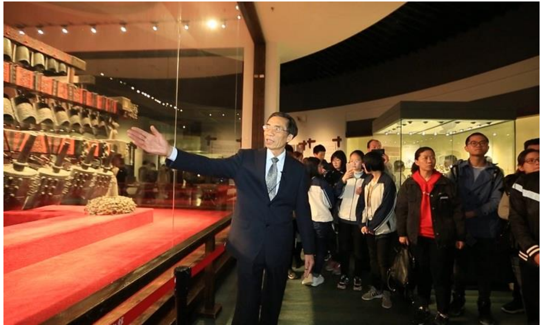
City of reading