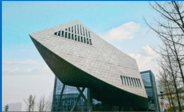
City of art