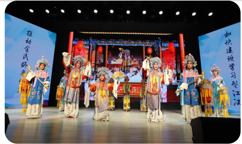
“Lifelong Education Alliance” Achievement Exhibition

“Lifelong Education Alliance” has been established. Through the formation of many lifelong education alliances such as “Wuhan Education and Reading Alliance”, “Hanyang Tree”, “College Community Education”, “Ecotourism Agriculture”, “Bosom Friend Culture” and “Mulan Culture”, the service functions of government departments and high-quality education and cultural resources can be developed and shared jointly, and the industry sectors in the region can complement each other's advantages, making the alliances an important channel for citizens to increase their knowledge and improve their literacy through interactions.