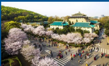
City of universities