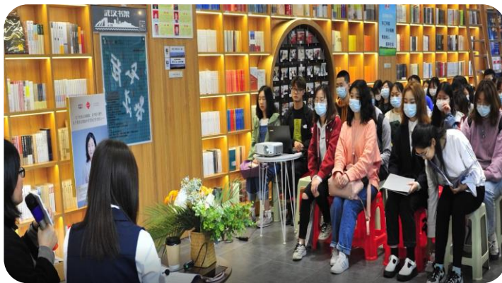
New reading space of “bookstore + library”

The innovative “Design City · Scholarly City” has integrated cultural and creative design with learning city to improve citizens’ learning awareness and capabilities. It has opened up a new reading space of “bookstore + library”, turned cafes into “mini-libraries”, made the Dandelion Happy Reading Town enter communities, and changed 108 museums, such as Wuhan Museum, Wuhan Museum of Science and Technology and Wuhan Industrial Heritage Museum, into pluralistic learning places, adding more fun to citizens’ learning.