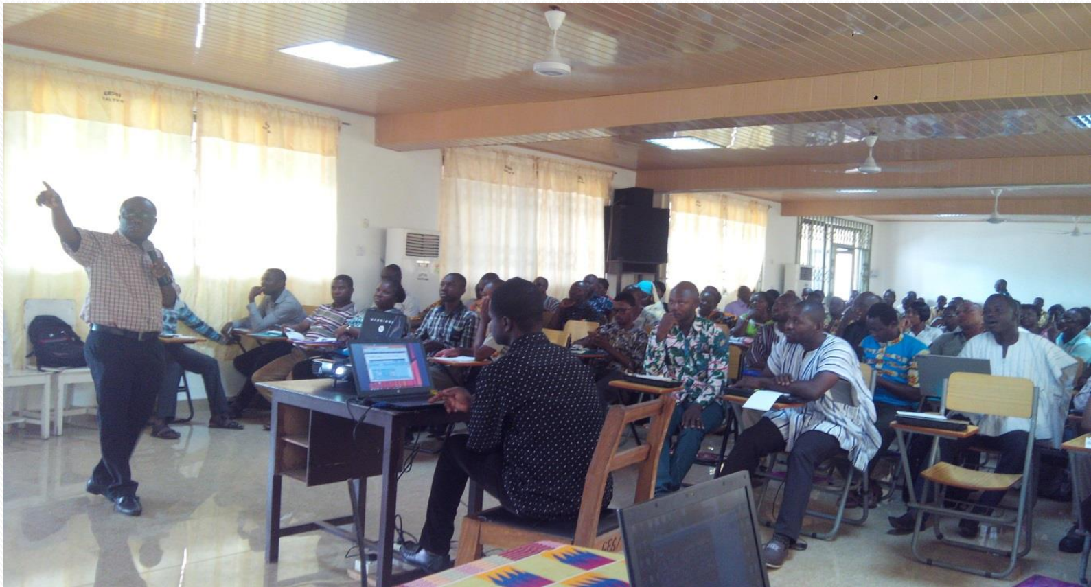
The Installation of EMIS Application Being demonstrated to Participants from Central, Western & Upper West