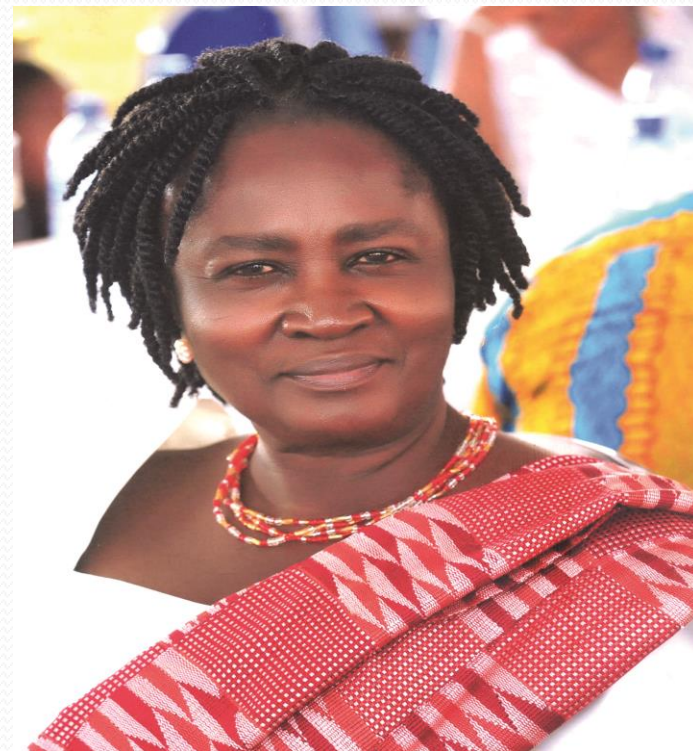
Prof. Naana Jane Opoku-Agyemang

Fully fledged EMIS from April 2002 to date.