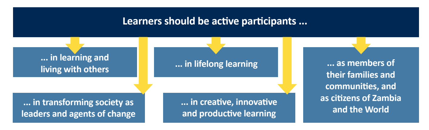
Figure 1. The vision for the curriculum in Zambia

Assessing learners' knowledge is much easier than assessing their attitudes, their skills and their competences. A key challenge for practitioners at all levels of the education system is to ensure that we measure what we value rather than valuing what we can easily measure . It is important to assess what learners know but, as we recognise the value of their attitudes and what they can do, assessments must also reflect these broader aspects of learning.