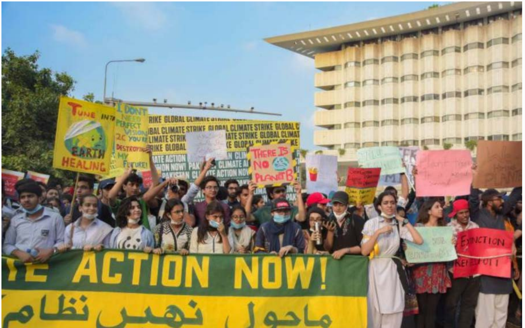
Pakistan, Karachi: protest against climate change, pollution