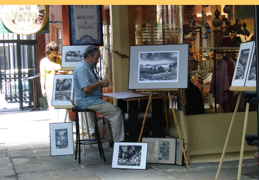
Montevideo painter by Emilia Garassino CC BY-SA 2.0

As global food supplies have been disrupted by the pandemic, some cities have responded to increase food security. In Montevideo ( Uruguay ), for example, citizens and local organizations are implementing a traditional model of home deliveries of food, fruits and vegetables called “ollas populares” – some directly from producers to consumers, with special attention to vulnerable people. In the city of Bamberg ( Germany ), a World Heritage Historic City, urban gardening has been practiced since the Middle Ages. These late medieval structures for gardening, and the traditional knowledge of how to farm them, have helped the city maintain a resilient food system during the crisis. Inspired by an initiative launched by UNESCO Creative Cities of Crafts and Folk Art Fabriano ( Italy ), bakers from several cities shared videos on social media on how to prepare the typical bread of local culture and tradition, including Paducah ( United States ), San Cristobal de Las Casas ( Mexico ) and Duran ( Ecuador ).