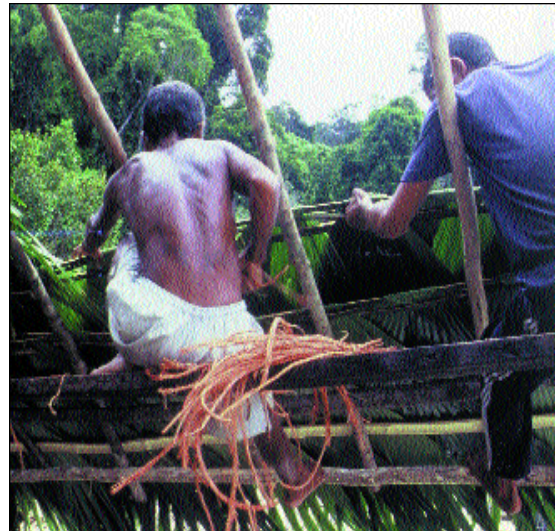
Moken men thatching their roof with palm leaves.

The Park Authority should also coordinate with the Tourism Authority of Thailand and the Association of Hotels and Tourism to draft guidelines for tourism management in 'special areas' such as national parks. In addition, tourism in national parks should offer basic services and simple facilities in order to avoid exploitation by developers. There should also be a serious campaign to discourage tourists buying products