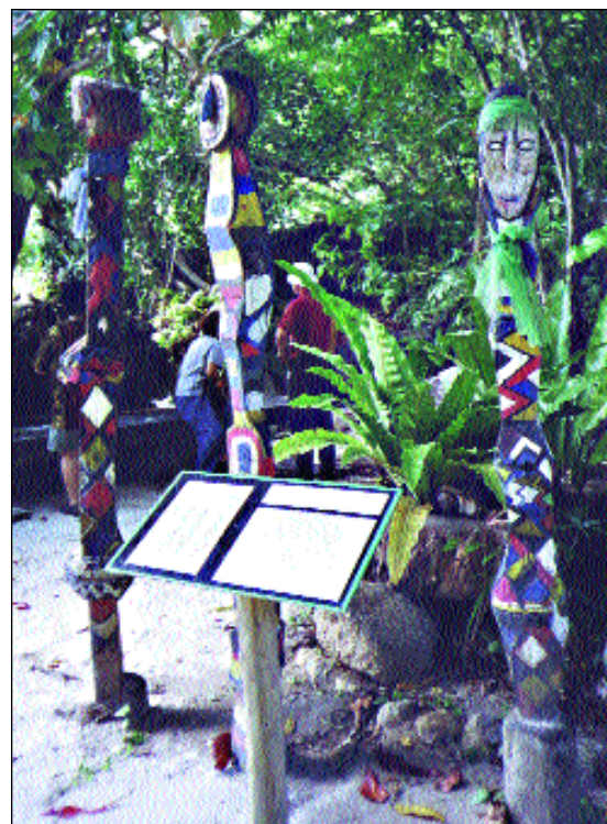
Moken totem poles at park headquarters.