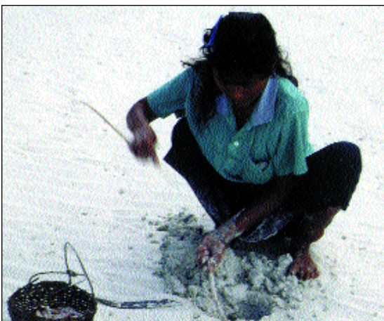
Moken woman gathering sand worms on a beach at low tide.

Throughout the Asia-Pacific region, it has been recognized that local people must be involved in the development of conservation regulations and be party to their implementation if the regulations are to be successfully enforced. This also implies that there must be recognizable benefits for the local population that offset the constraints imposed by regulations. For the Moken of the Surin Islands, their continued presence and use of natural resources within the park area will be facilitated by receiving and accepting their shared responsibility for safeguarding heritage values, so that together with local authorities and government departments, they can explore sustainable development opportunities.