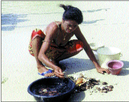
Moken woman cleaning seashells for sale to tourists. This picture was taken in 1994 before the park authorities enforced a ban on the collection and sale of shells on the islands in 1997.

With the declaration of the Surin Islands as a national park in 1981, restrictions on the fishing and foraging activities of the Moken were imposed. Despite national park status, the Moken continue to live off the resources found on the land and in the sea. The extraction of natural resources by the Moken is not without environmental impact. Their gathering patches are somewhat over-exploited since they have adopted a more sedentary lifestyle. Due to the