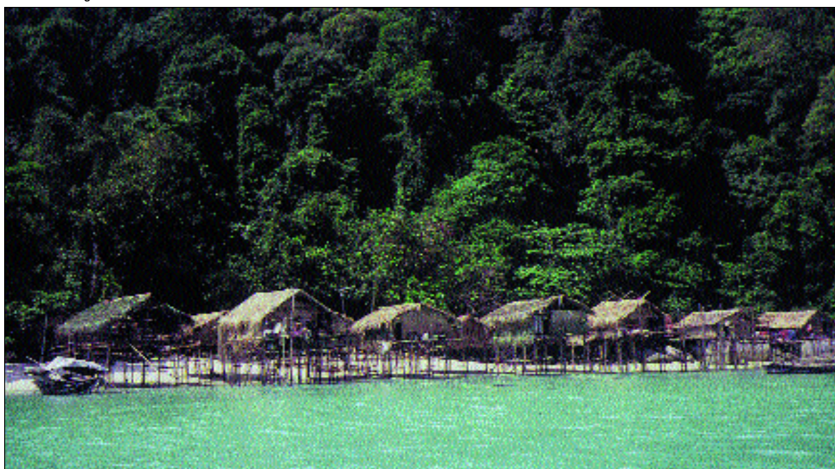
A Moken village on South Surin Island.

The park covers an area of about 135 km 2 , of which 76 per cent is sea, and comprises five