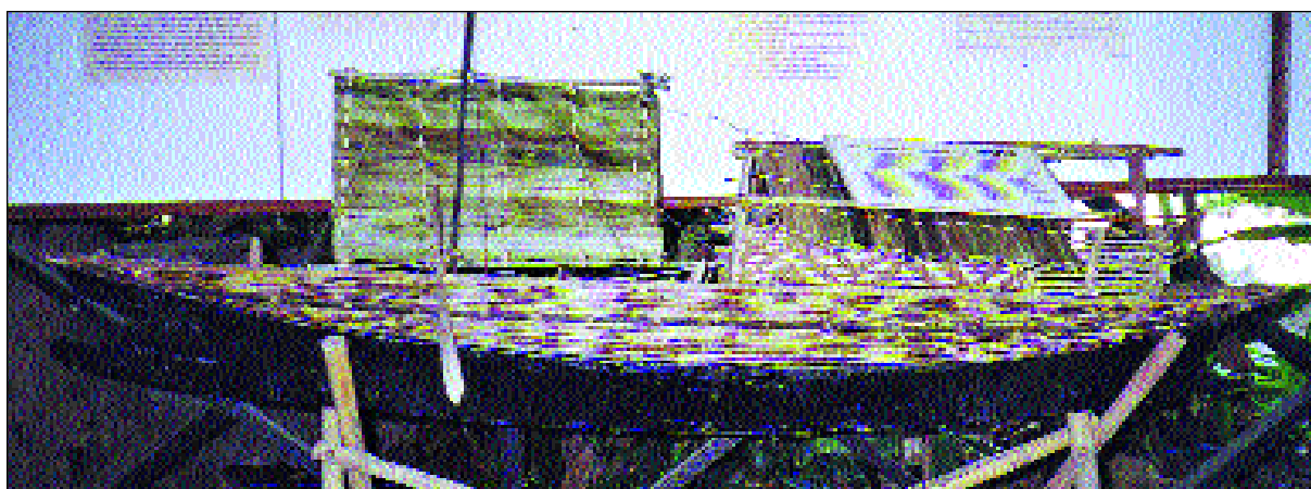
Model Moken boat on display at park headquarters

This activity is designed to increase the Moken's ability to generate income for themselves; to strengthen cultural pride; to preserve traditional