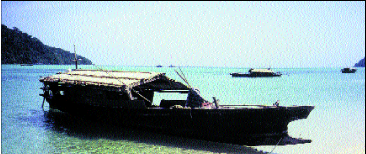
The Moken spend almost half of their life in a 'Kabang', the traditional boat of the Moken. Wooden planks have replaced the Zalacca wood as the preferred material of the gunwale. A bifurcated bow and stern is a distinctive characteristic of the Moken boat.

islands (see map on inside front cover). A few kilometres to the north of the park is the border with Myanmar, and about 100 km to the south are the Similan Islands, another marine national park.