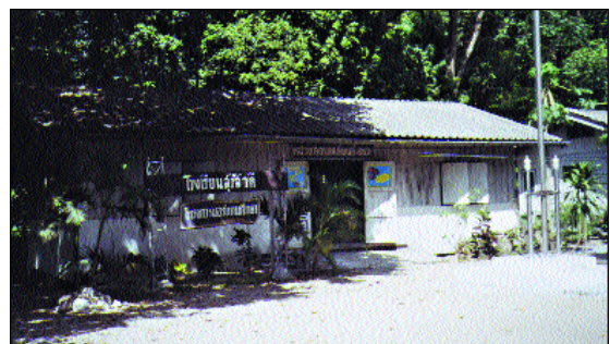
Fisheries building at Sai Ane Bay used as the school for the Moken children.