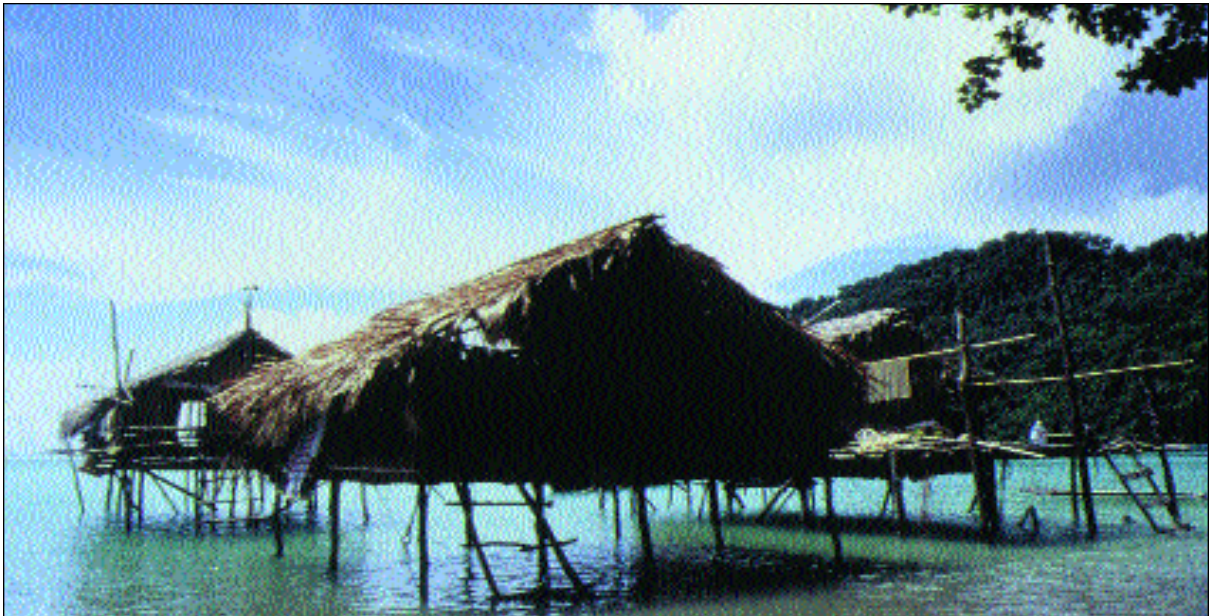
The Moken village does not represent a permanent settlement, since the Moken tend to move whenever serious illness and death strike. Mobility is also a social mechanism in coping with conflicts. This pattern of semi-permanent settlement should therefore be encouraged instead of suppressed.

epidemics, alleviate disputes or in response to a bad omen. Periodic movement is significant for former nomadic groups like the Moken and it facilitates local ecological recovery as foraging patches are allowed to revive. Over the past ten years, the Moken have shifted their settlements to five different beaches on Ko Surin Nua and Ko Surin Tai.