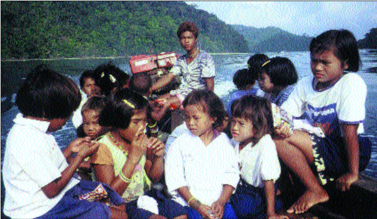
Moken children, some in school uniforms, take a boat shuttle to the small school on North Surin Island.