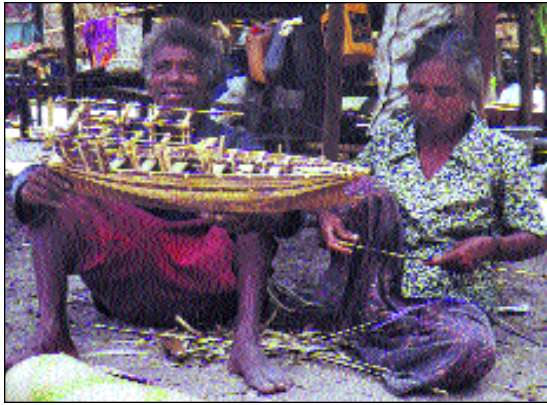
Selling model boat and mats at Moken village.