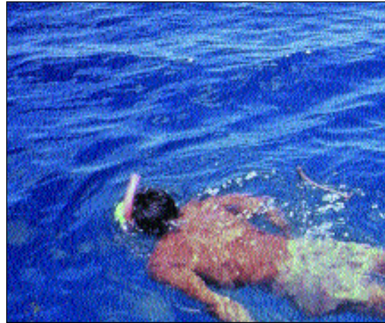
Diving for fish, shellfish and other marine animals is an important source of livelihood for the Moken.

With the support of UNESCO, the Marine Parks Division of the Royal Thai Forest Department is teaming up with anthropologists from Chulalongkorn University to explore ways in which the Moken, with their indigenous knowledge, can become partners in the conservation of