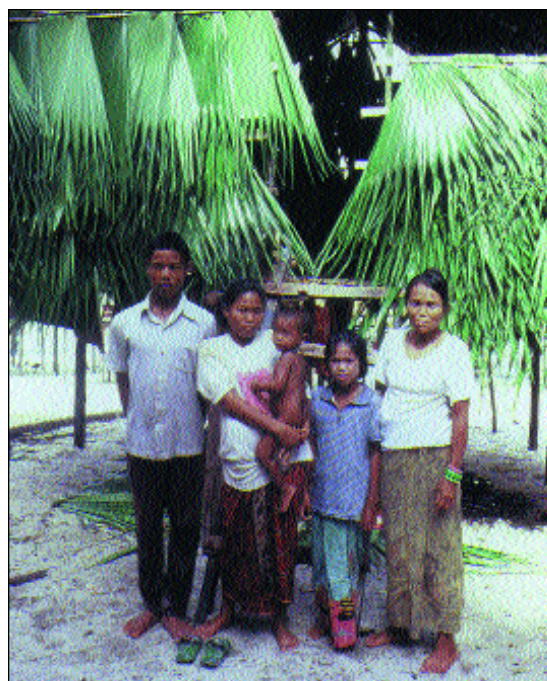
A Moken family in front of their hut.

A major problem among the Moken is substance abuse. Suraswadee School has started a campaign against drug addiction involving the youths, but adult education is important as well. The Park Authority should have access to educational videos and posters explaining the deadly effect of substance abuse. NGOs may be able to provide assistance. The Park Authority should seek help from the Narcotics Control Unit and exert restrictions over fishing vessels, as they are blamed for trafficking drugs in the area.