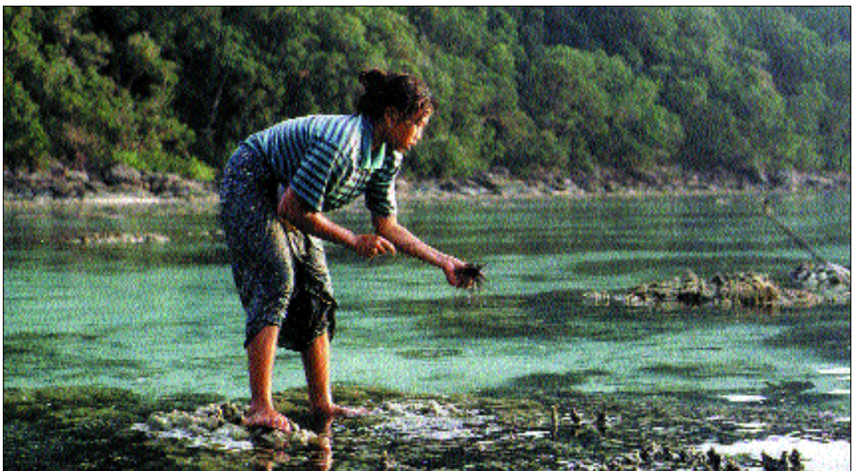
Moken woman gathering sea urchins on the reef flats.

Despite the Moken's use of the islands' natural resources, there are no obvious signs of severe over-exploitation. Damage to the ecosystems around the Surin Islands is mainly the result of illegal fishing activities by the semi-industrial Thai fishing fleets and reef damage resulting from the anchoring of pleasure boats. No dynamite fishing or cyanide fishing is evident in the waters around the Surin Islands. In fact, the Moken are not considered true fishers, since they mainly extract resources from the reef and mud-flats by gathering, rather than fishing.