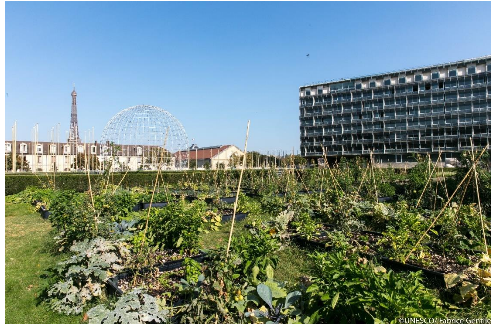
Come and visit the vegetable garden of UNESCO Headquarters, located on the Piazza

Reducing heating by just one degree - for example 20°C instead of 21°C - can save about 7% in energy consumption. (ADEME 2020).