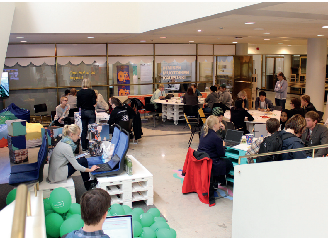
Helsinki Lab is both a developer community and an open city laboratory where various city development projects meet.

Helsinki Lab offers counselling to City units on how to use design for the best impact. The lab has selected design service providers for use by all City units. It promotes the use of design by advocating the added value produced by design, and it collaborates with universities. Helsinki has exchanged benchmark information related to Helsinki Lab with several UCCN cities.