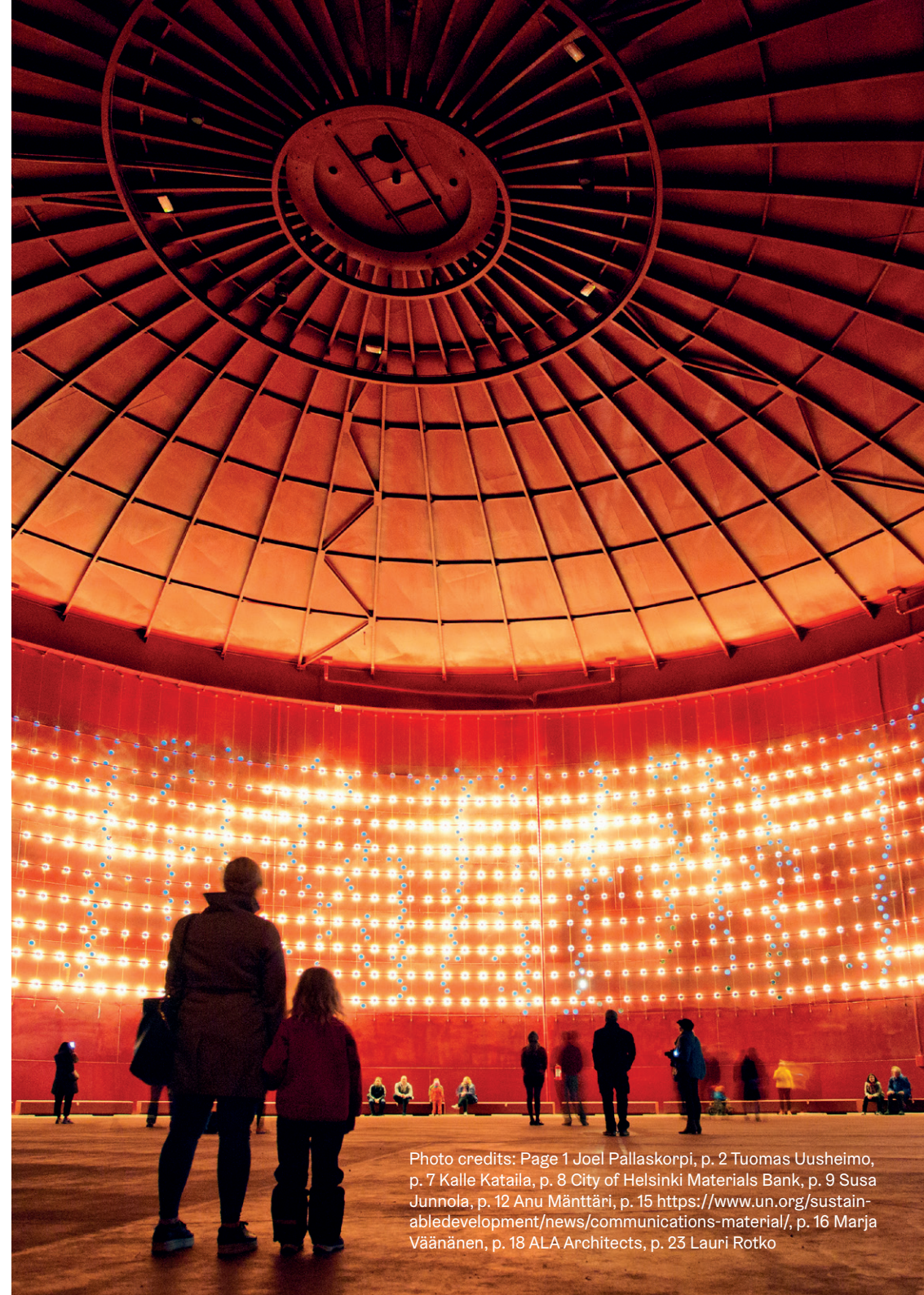
Photo credits: Page 1 Joel Pällaskorpi, p. 2 Tuomas Uusheimo, p. 7 Kalle Kataila, p. 8 City of Helsinki Materials Bank, p. 9 Susa Junnola, p. 12 Anu Mänttäre, p. 15 https://www.un.org/sustainabledevelopment/news/communications-material/ , p. 16 Marja Väänänen, p. 18 ALA Architects, p. 23 Lauri Rotko

Finnish design enterprises are small in size. 71% of the enterprises employed less than 2 persons on average in 2016. 8% of the enterprises employed 10 people or more. All industries included in the Finnish design sector employed a total of 55,000 people, according to Statistics Finland. This was 2.3% of the total workforce.