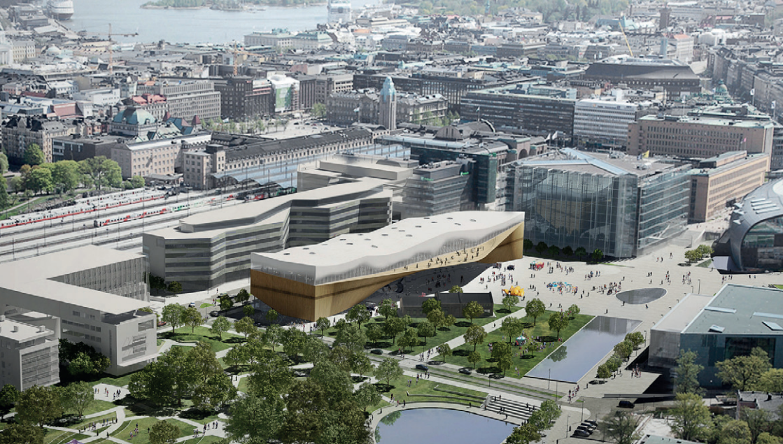
Citizens' dreams helped build the new library long before the building construction started.

“I began experiencing ownership of the city, and for the first time in my life I felt I was truly a Helsinkian.” – A Friend of the Central Library