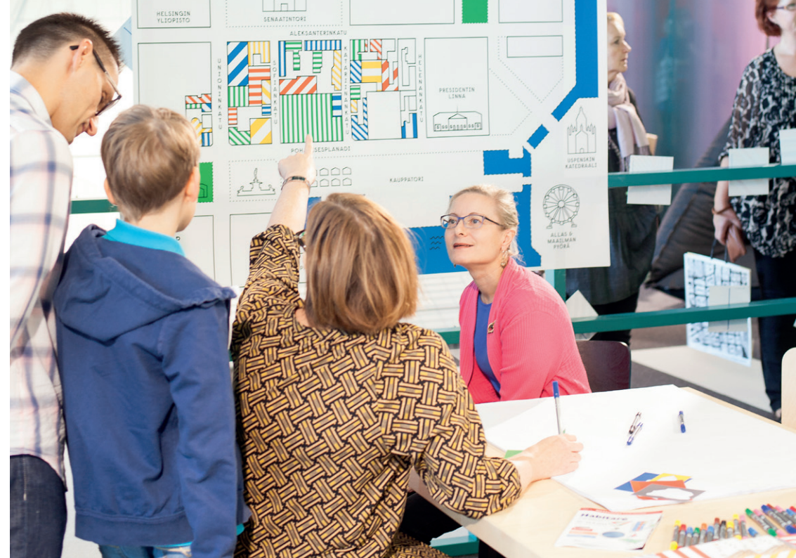
Design Driven City worked as a facilitator between the planners and the users of the city.

“Cities are for users. Cities need design in order to function. Design creates better services for residents. A functional city is a good city.” – 4 of the 10 theses of Design Driven City