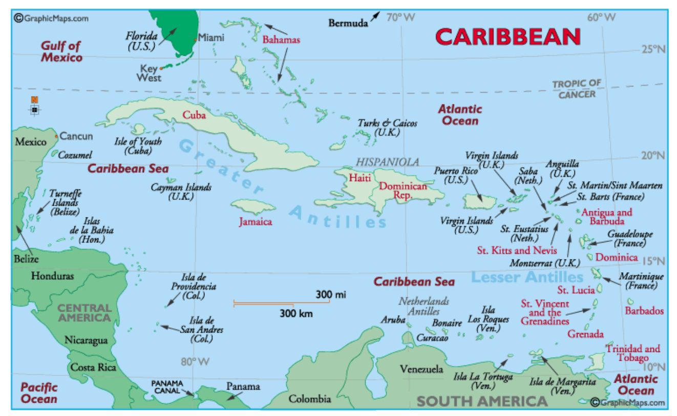
Bahamas: Key facts and figures (November 2021) - Page 4/4