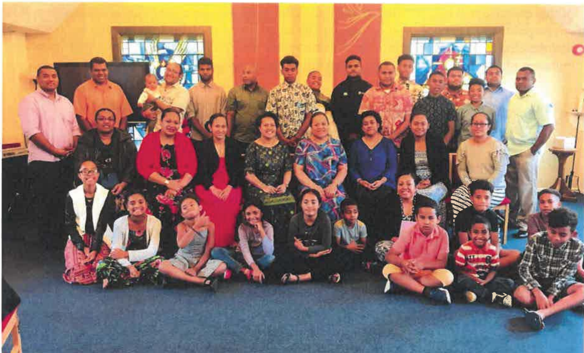
Christian Mission Fellowship Group, Aldershot, July 2018.