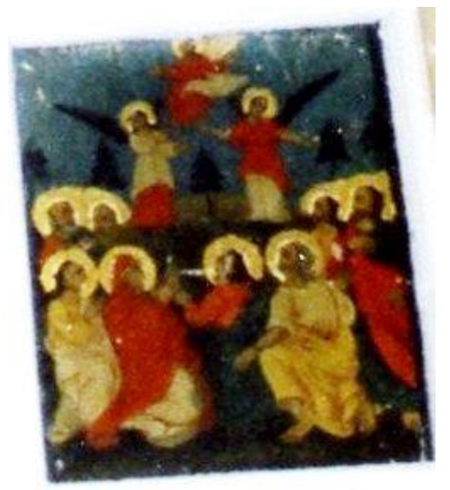
Icon of Ascention of Jesus Christ