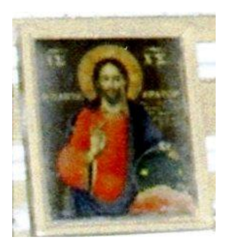
Icon of Jesus Christ Pantocrator