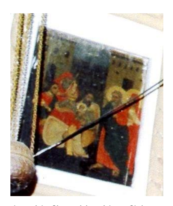
Icon of the Circumcision of Jesus Christ