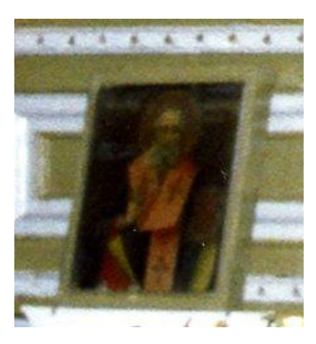
Icon of Saint Athanassios