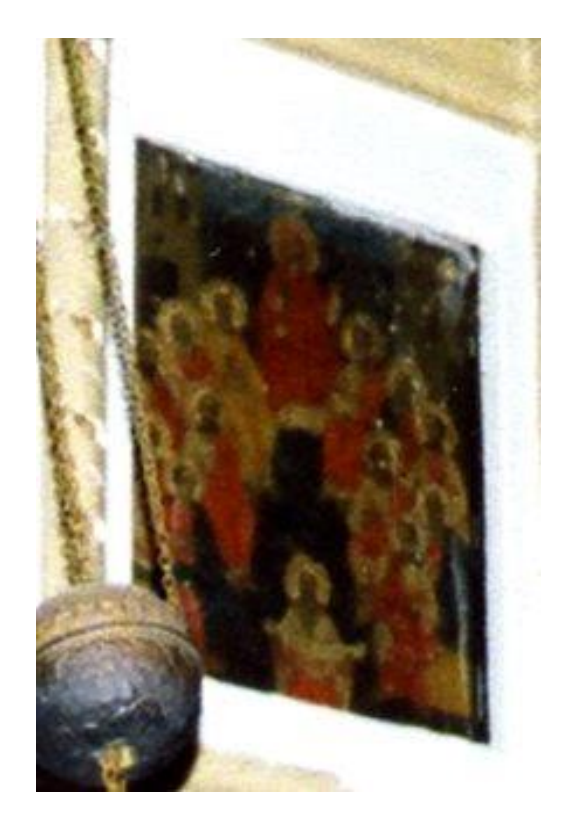
Icon of the Pentecost