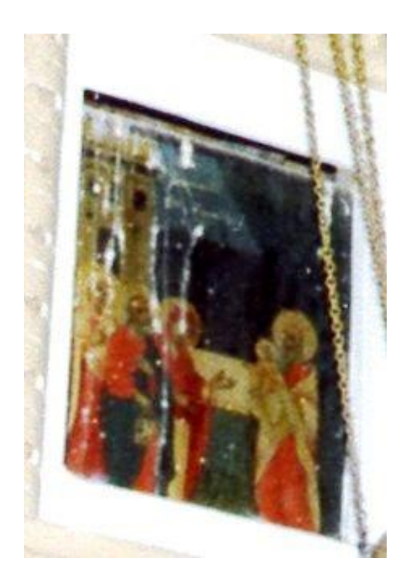
"Christ in the Temple" Icon