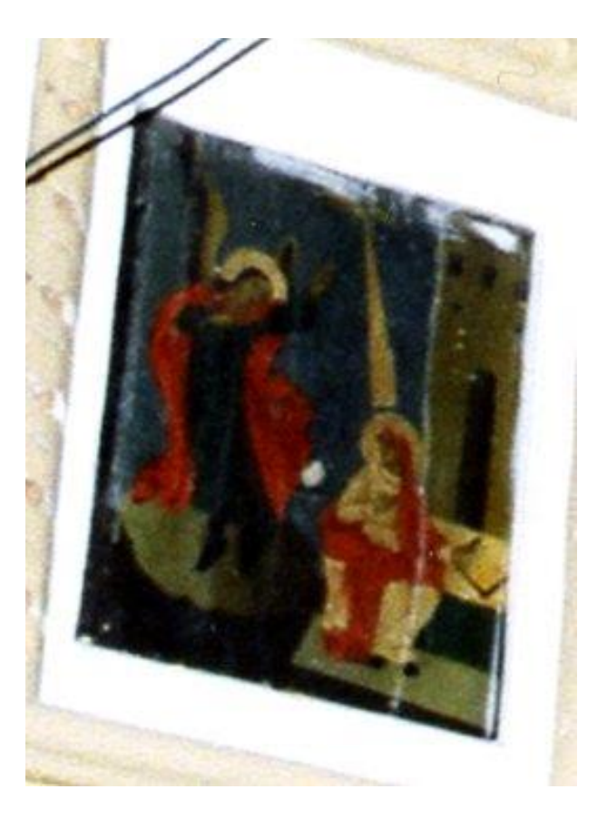
Icon of the Annunciation of Virgin