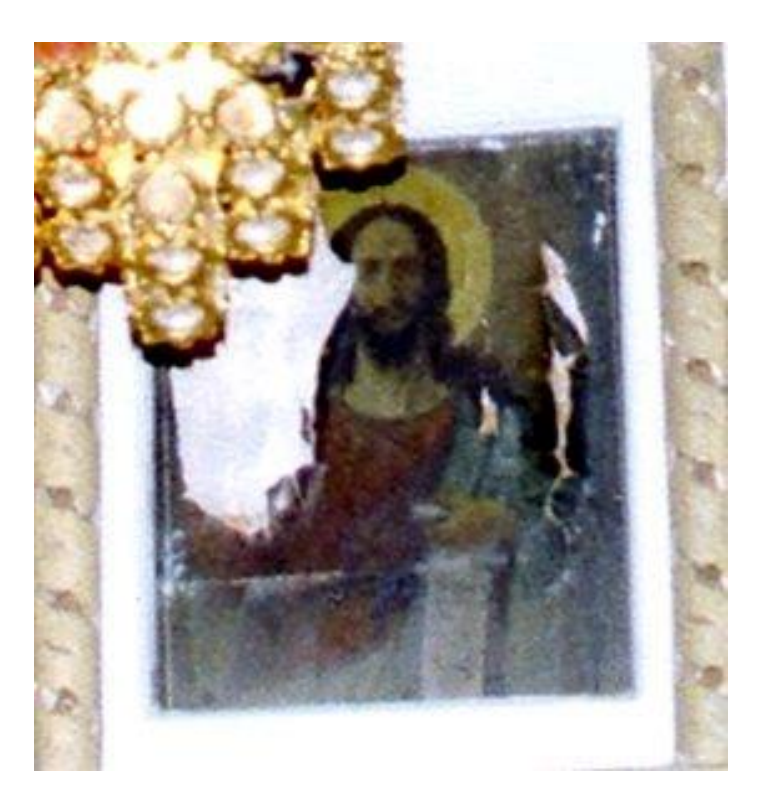
Icon of Saint John the Baptist