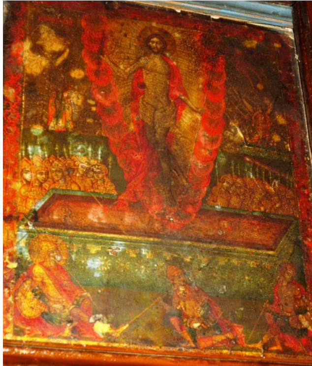
Picture 1 - Icon of the Resurrection of Jesus Christ

1. Icon of the Resurrection of Jesus Christ: dim. 0,38 - 0,41m X 0,29 m - 0,31 m, about. Date: end of the 19th century.