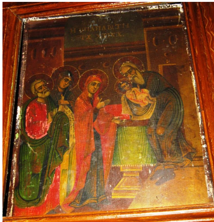
Picture 4 - Icon of Christ the temple

4. Icon of Christ in the temple, dim. 0,38 - 0,41m X 0,29 m - 0,31 m, about. Date: end of The 19th century.