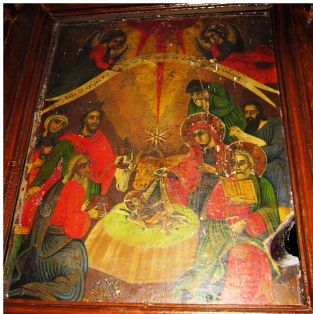
Picture 2- Icon of the Nativity of Jesus Christ

2. Icon of the Nativity of Jesus Christ, dim. 0,38 - 0,41m X 0,29 m - 0,31 m, about. Date: end of the 19th century.