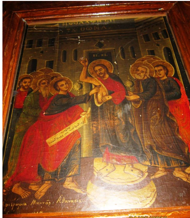
Picture 9 - Icon of the Incredulity of Saint Thomas