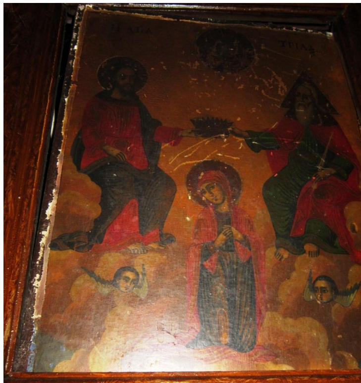
Picture 8 - Icon of the Coronation of Virgin Mary

8. Icon of the Coronation of Virgin Mary, dim. 0,38 - 0,41m X 0,29 m - 0,31 m, about. Date: end of the 19 th century.