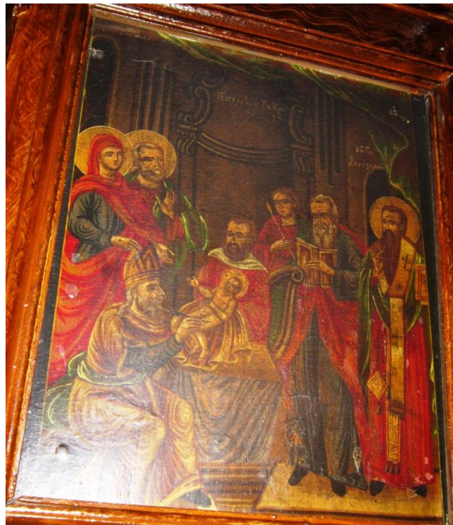
Picture 3- Icon of the Circumcision of Jesus Christ

3. Icon Circumcision of Jesus Christ, dim. 0,38 - 0,41m X 0,29 m - 0,31 m, about. Date: end of the 19th century.