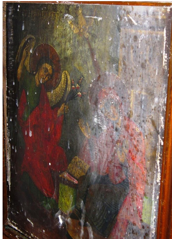
Picture 10 - Icon of the Annunciation of Virgin Mary

10. Icon of the Annunciation of Virgin Mary, dim. 0,38 - 0,41m X 0,29 m - 0,31 m, about. Date: end of the 19th century