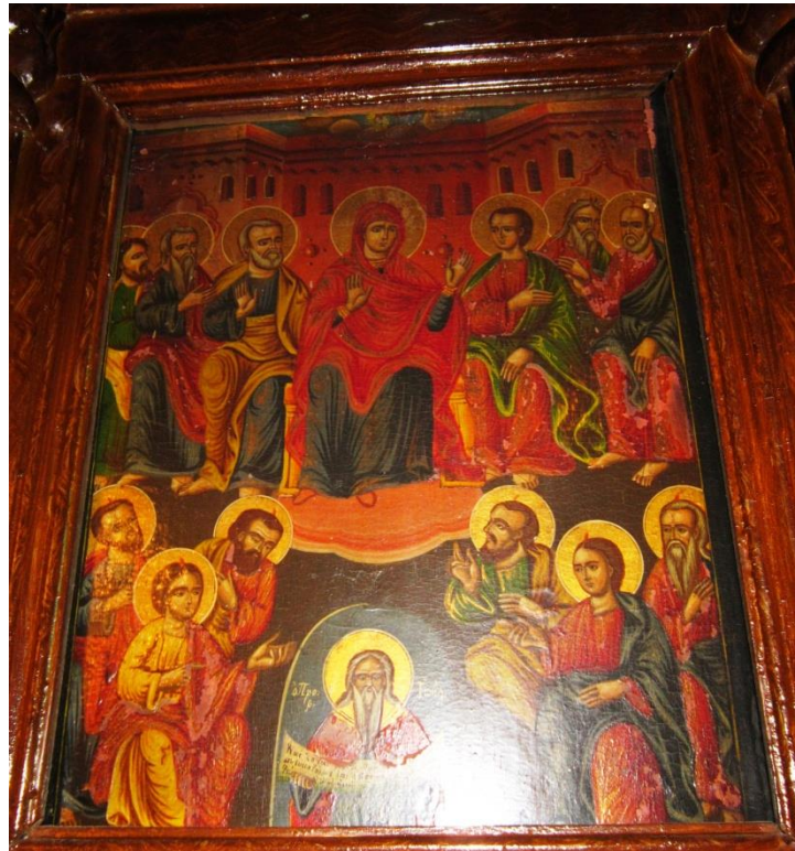
Picture 7 - Icon of the Pentecost

7. Icon of the Pentecost, dim. 0,38 - 0,41m X 0,29 m - 0,31 m, about. Date: end of the 19 th century.