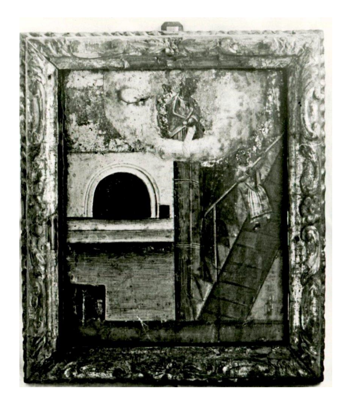
Virgin Mary the Climax