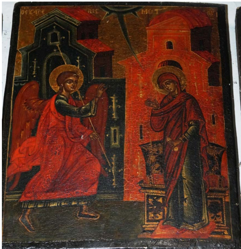
Annunciation of Virgin