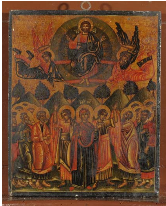
Ascension of Jesus Christ