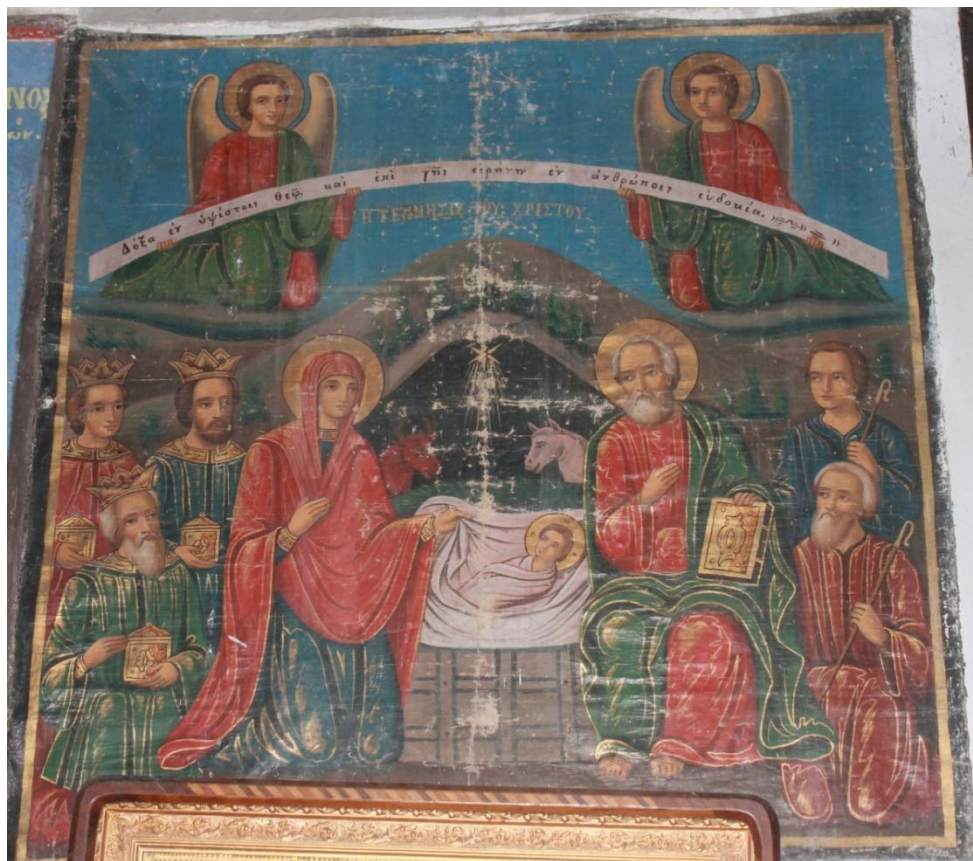
Nativity of Jesus Christ