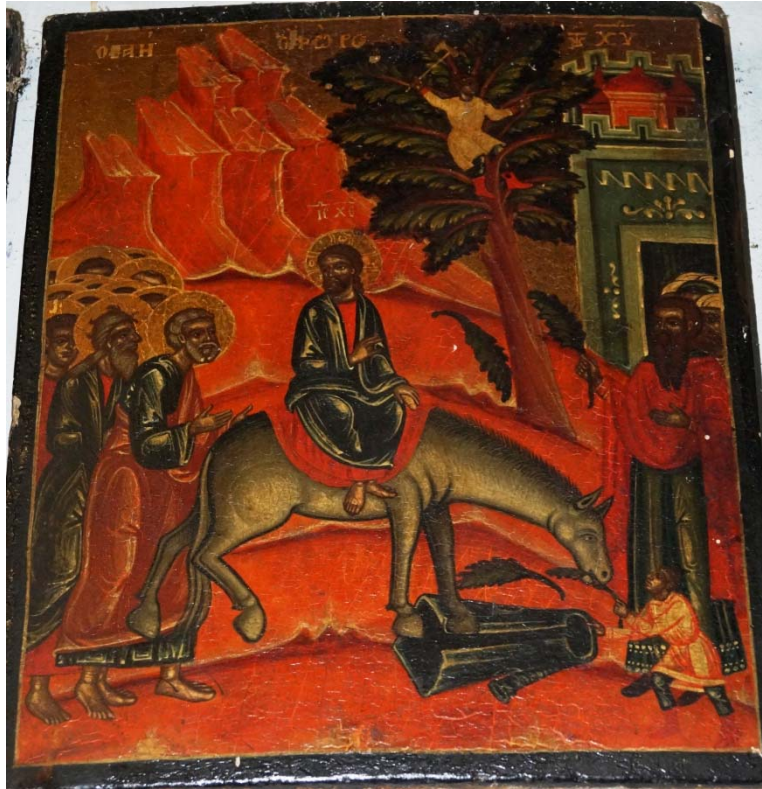
Entry into Jerusalem