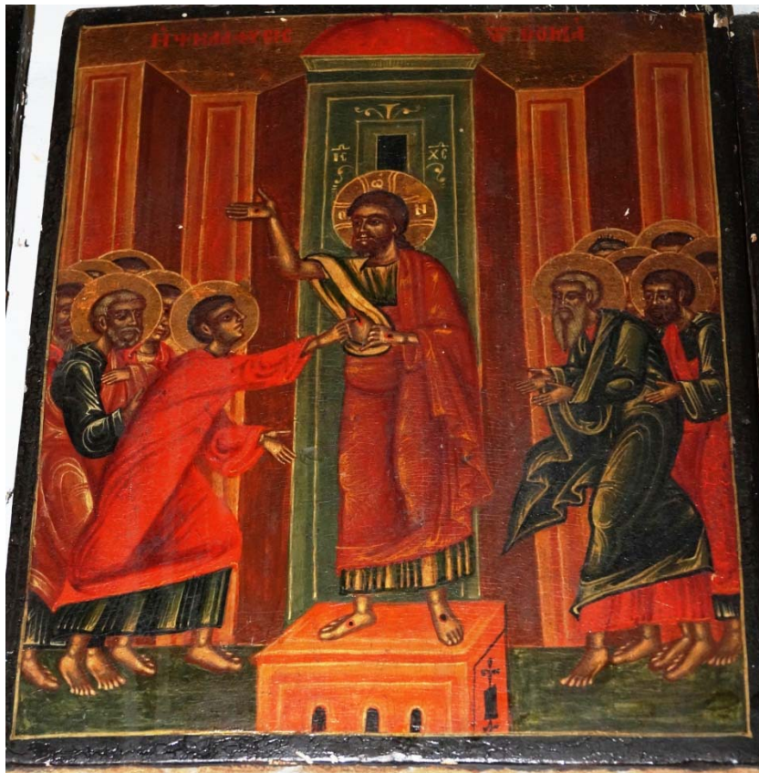
Doubting of Thomas