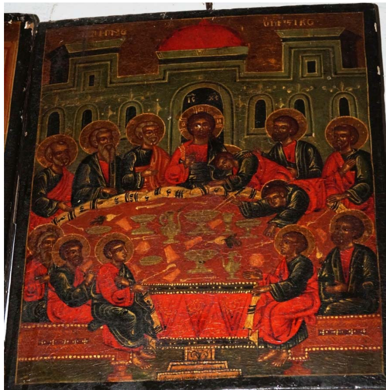
The Last Supper