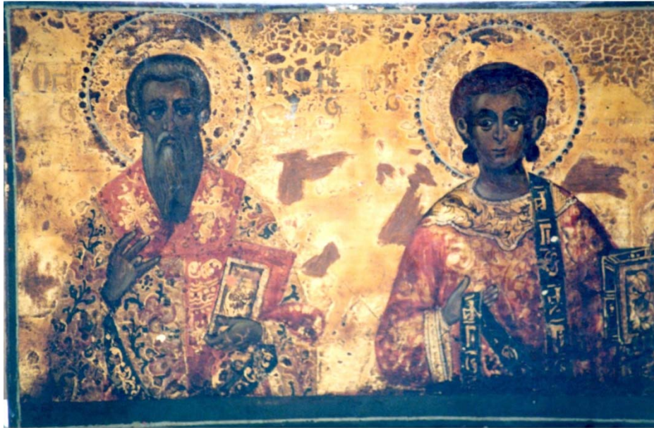
Saint Ignatius and Saint Stephen