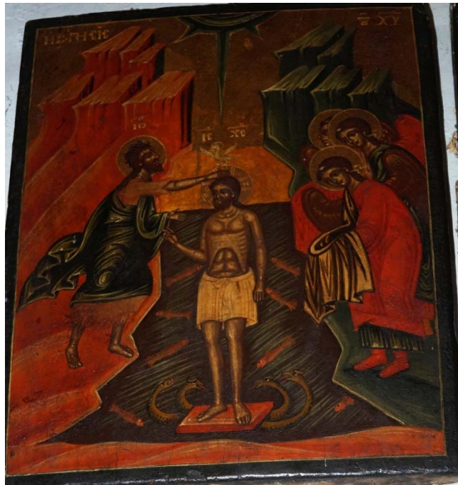
Baptism of Jesus Christ