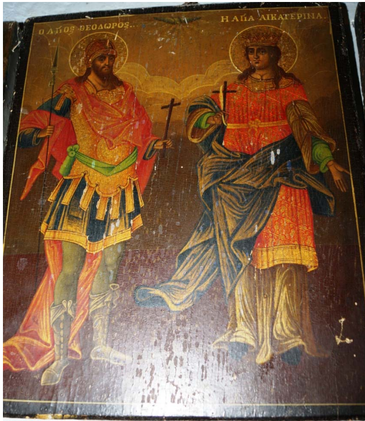
Saint Theodoros and Saint Ekaterina