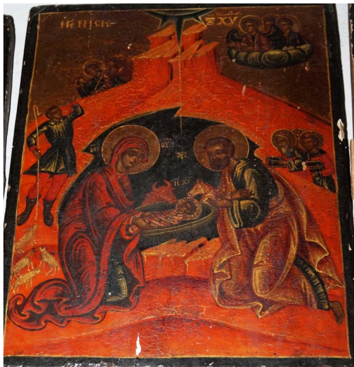
Nativity of Jesus Christ