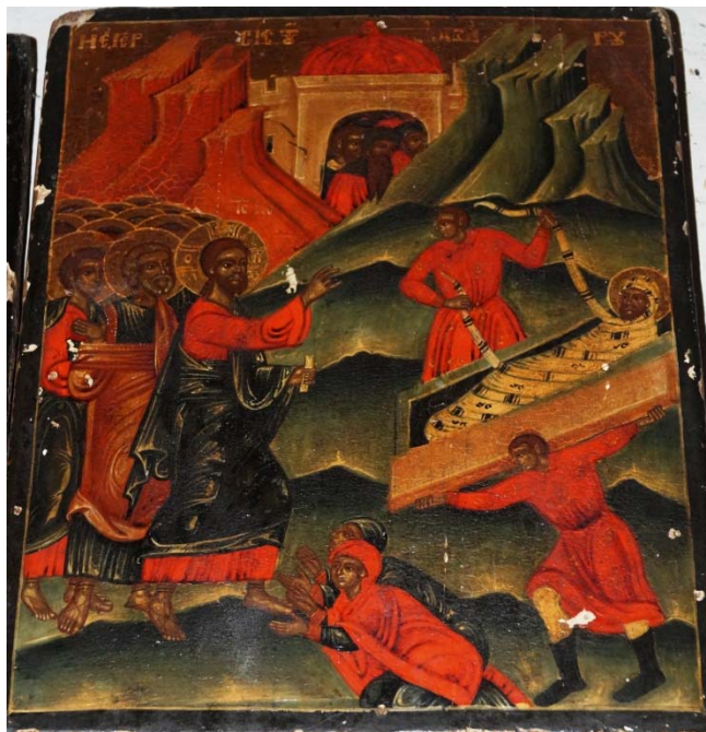
Raising of Lazarus