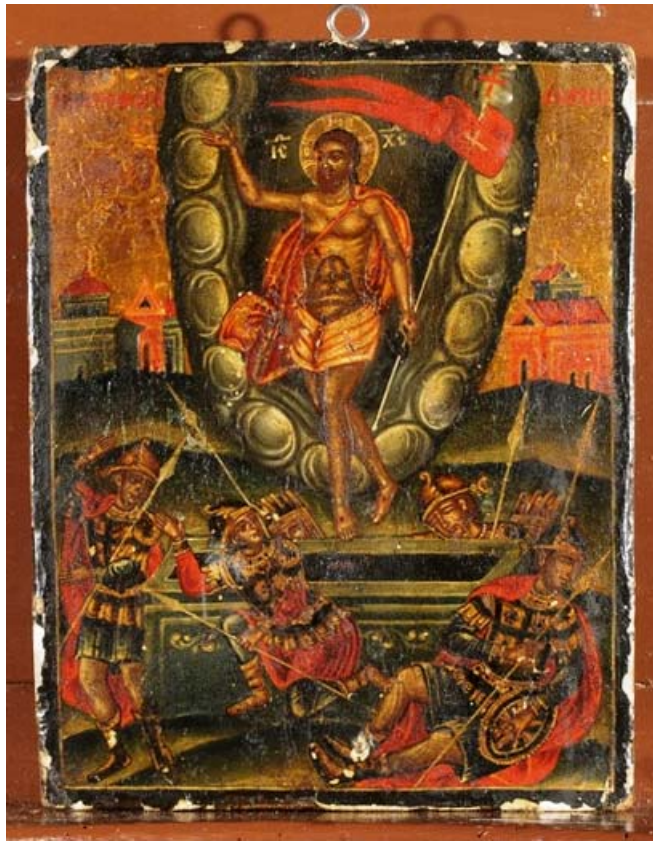
Resurrection of Jesus Christ