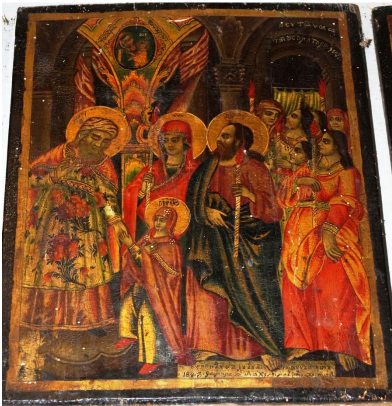
The Presentation of Mary in the temple