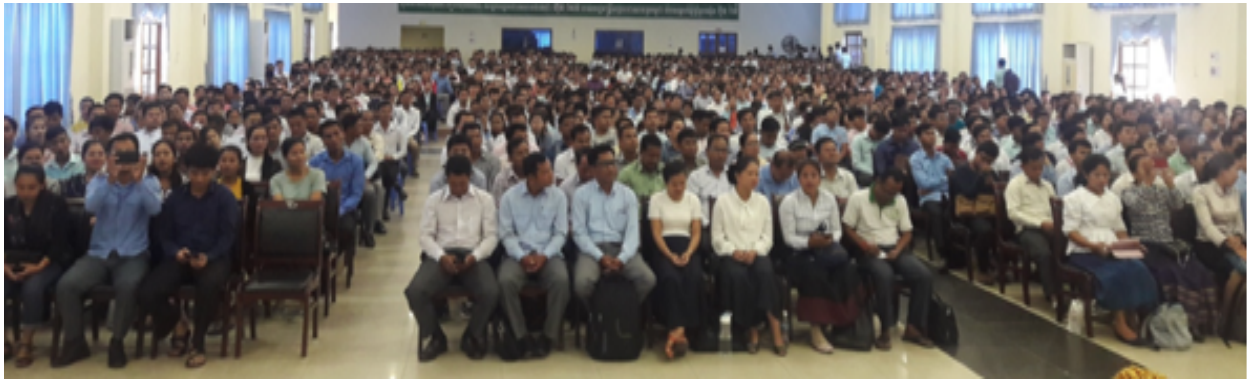
Classroom Activity: Designing ESD-integrated Lesson Plans

Activity 1: NIE's activities and practices to promote ESD through Pre-service Lecture on mainstreaming and integrating ESD into USS Teacher Training syllabi and Lesson Plans