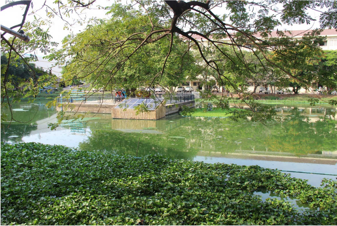
Waste water cleaning project using plant and solar powered oxygenation process