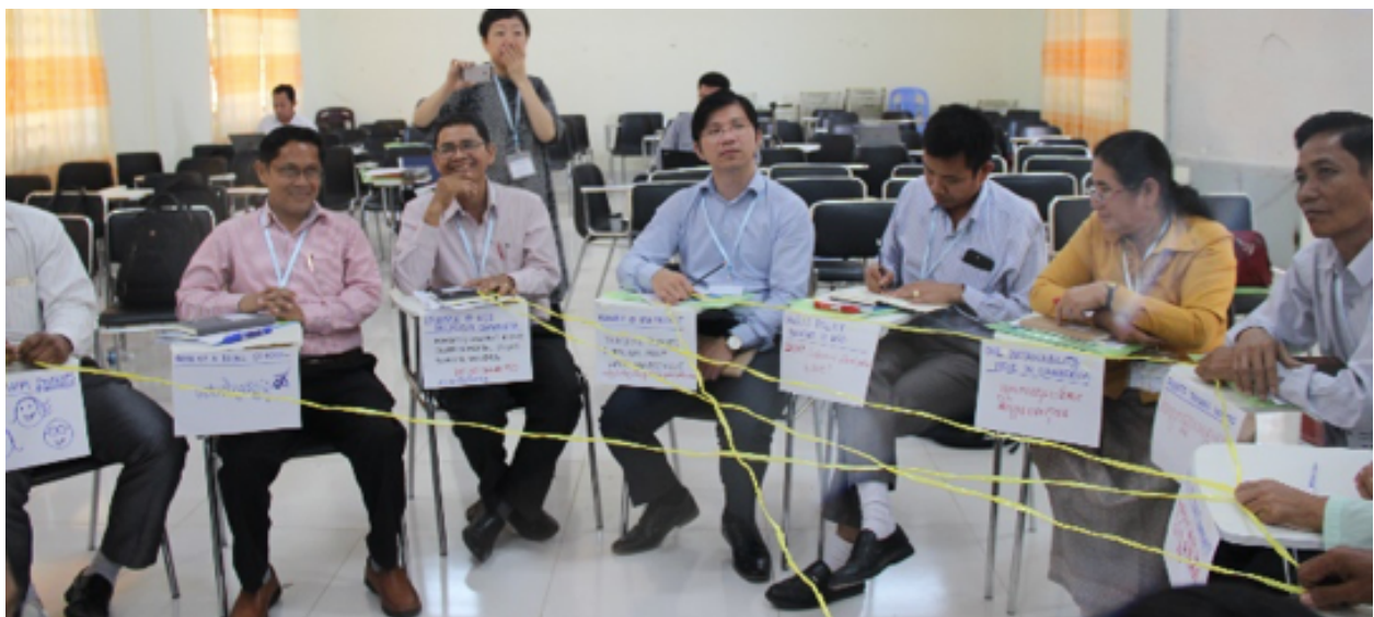
Demonstration of how everything is connected in the world and in ESD training