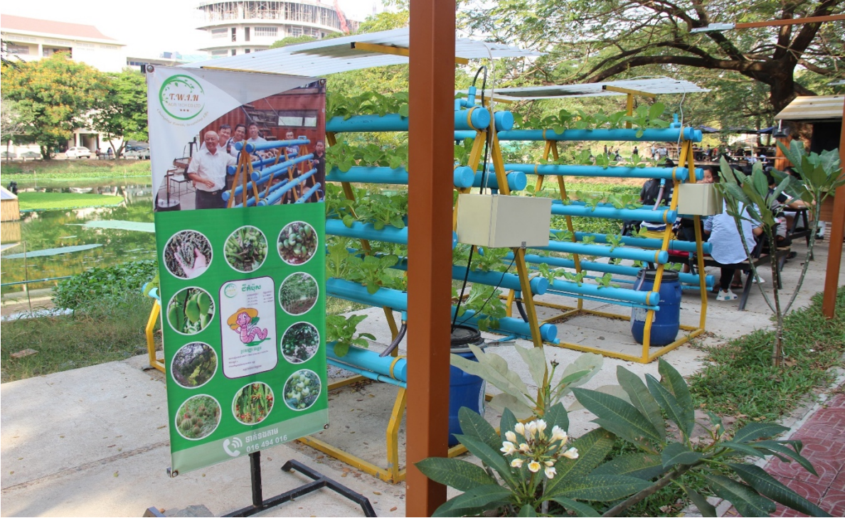
Students' project on growing vegetable on water