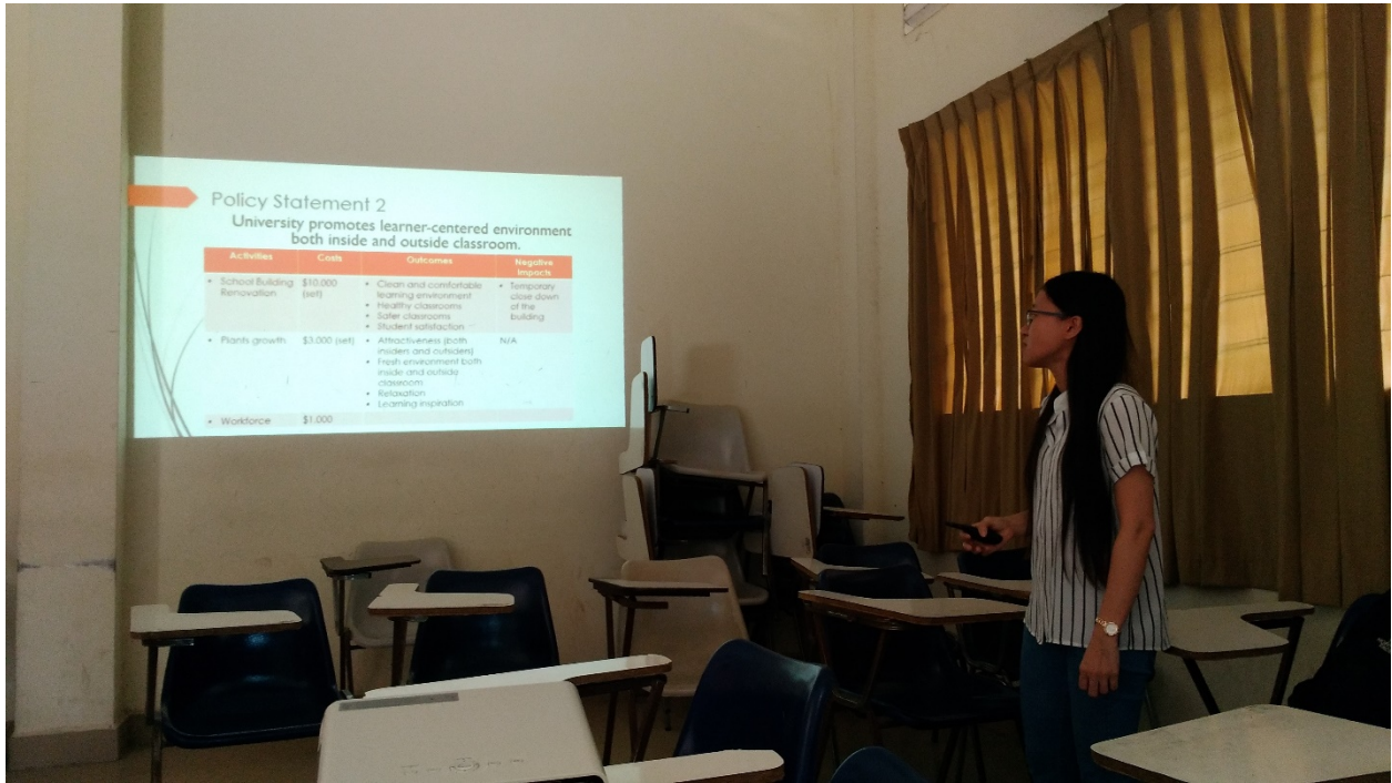
The implementation of the ESD concepts at classroom levels in the Faculty of Education, Royal University of Phnom Penh