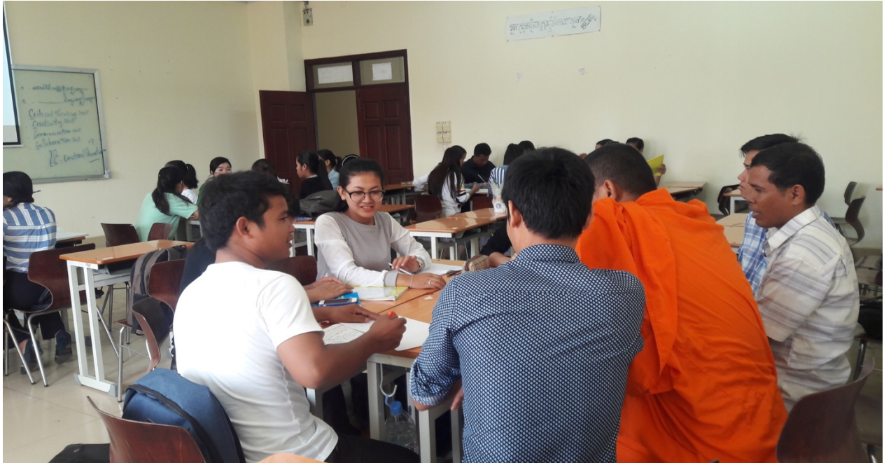
Cascading workshop on ESD in Kampot Province on 01-02 February 2018