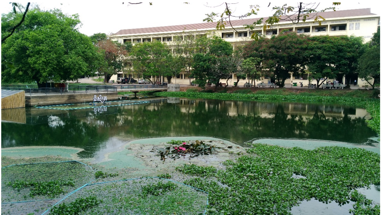
Waste water cleaning project using plant and solar powered oxygenation process

At university level, ESD concepts were implemented as separate student projects funded by the university. These projects included the replacement of normal street lighting within the two campuses to solar powered lighting. Another project was waste water treatment using water plants and solar powered water oxygenation. What students learned from those projects was encouraged to share with other students and other people in their communities.