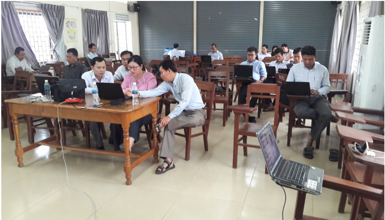
Workshop on Revising and Harmonizing PREST and INSET USS Teacher Training Syllabi in Kampong Cham Province: 29 March-02 April 2018