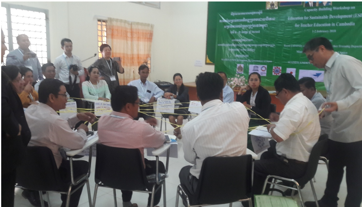
In-service Workshop on ESD's Integration in Modulkiri province