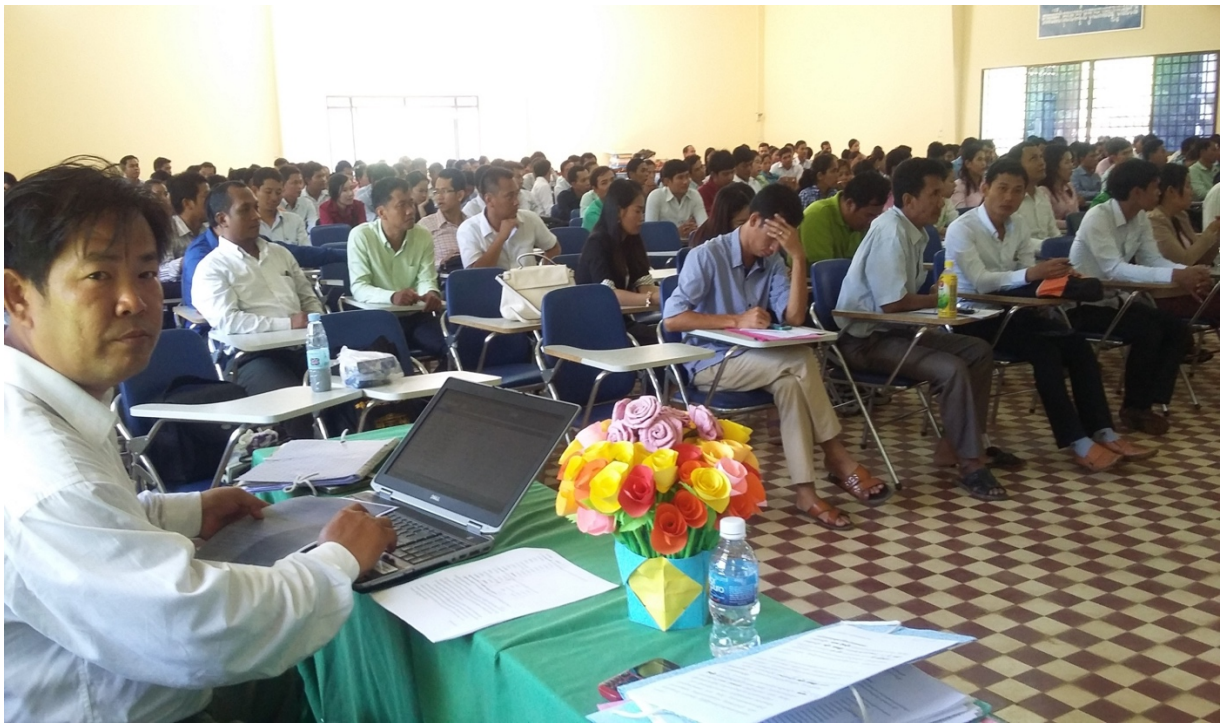
Workshop on Revising and Harmonizing PREST and INSET USS Teacher Training Syllabi in Kampong Cham Province: 29 March-02 April 2018