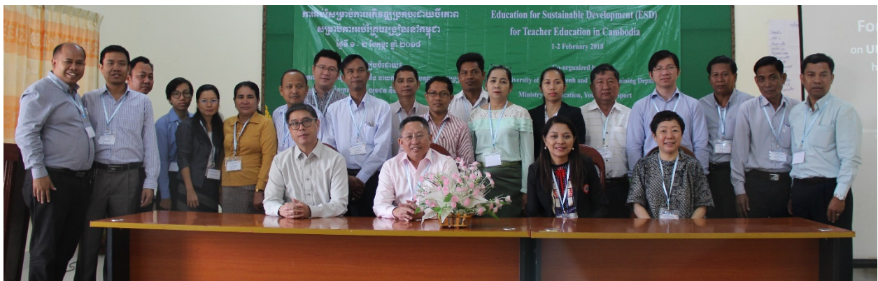
Launching of ESD workshop among teacher trainers in Kampot Province, Cambodia

The key targets in the in-country workshop were leaders and teacher educators from Royal University of Phnom Penh (RUPP), National Institute of Education (NIE), Teacher Training Department (TTD), Phnom Penh Teacher Education College (PPTEC), Takeo Regional Teacher Training Center, (TRTTC) and Kampot Provincial Teacher Training College (KPTTC). 30 participants from those institutions attended the workshop and developed their action plan to spread ESD concepts further.