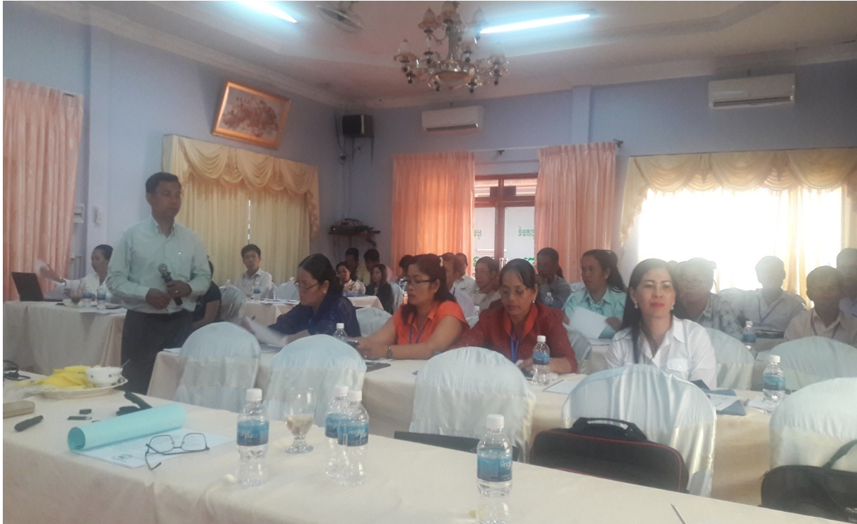
In-service workshop to enhance ESD organized and conducted by NIE