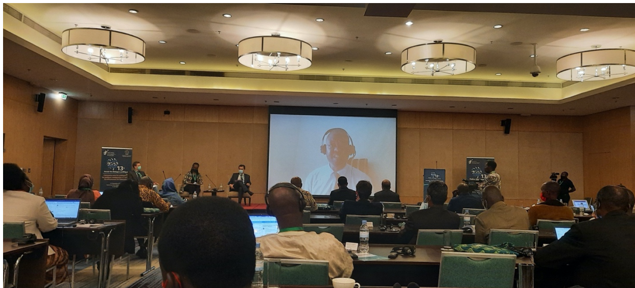
A session at the TTF Policy Dialogue on December 2, 2021.

This report is a summary of the proceedings and the points arising during the KIX break away session.