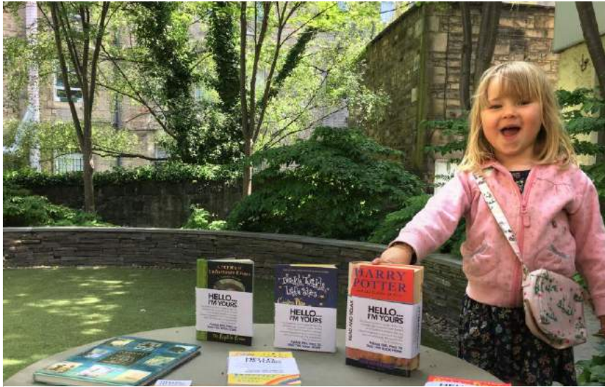
Reading Havens literary quarter community project 2019