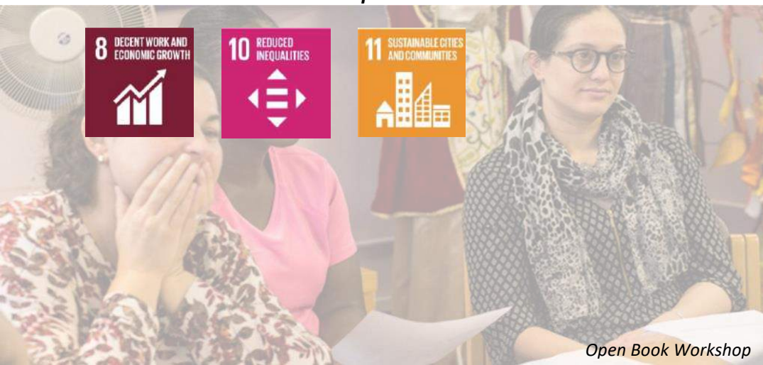
Open Book Workshop