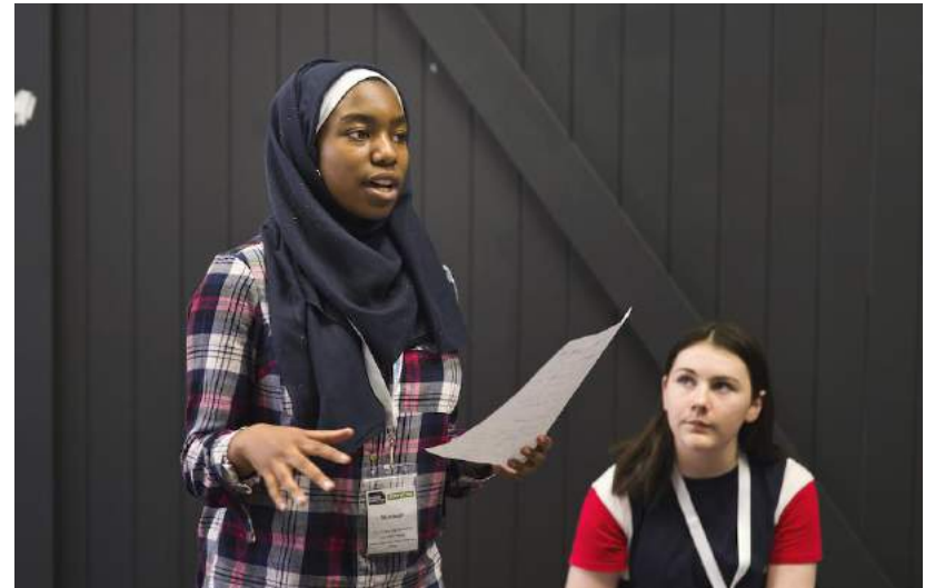
StoryCon 2019