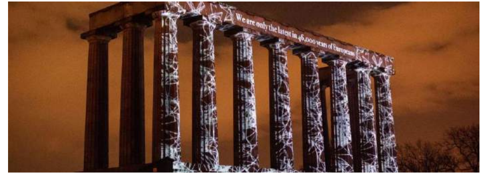
Message from the Skies: Love Letters to Europe 2019

https://www.edinburghshogmanay.com/explore/view/message-from-the-skies-2020-returns-with-shorelines-as-part-of-edinburghs-hogmanay