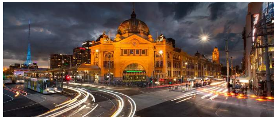
Melbourne City of Literature Streetscape

Links: http://cityofliterature.com.au/edinburgh-exchange