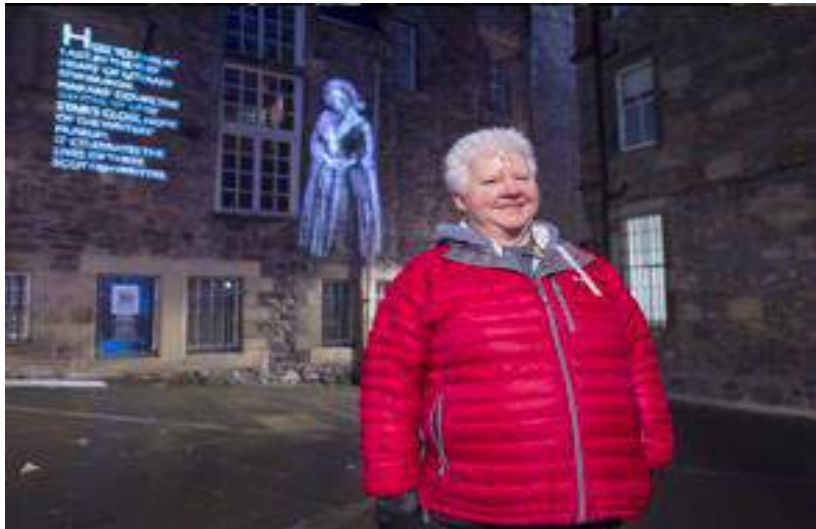
Val McDermid and Poem for Message from the Skies 2018