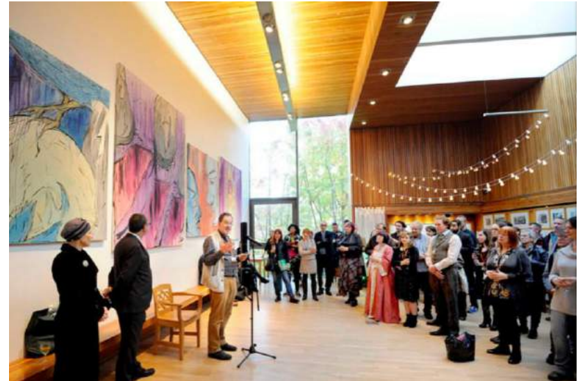
Opening of Scottish International Storytelling Festival 2017