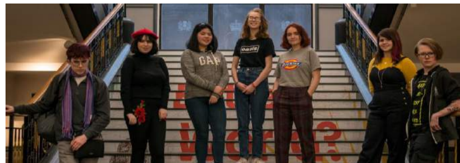
StoryBoard with Scottish Book Trust 2019

"There are really no words to describe how much StoryCon works wonders for people who want to meet new friends while working on valuable career skills."