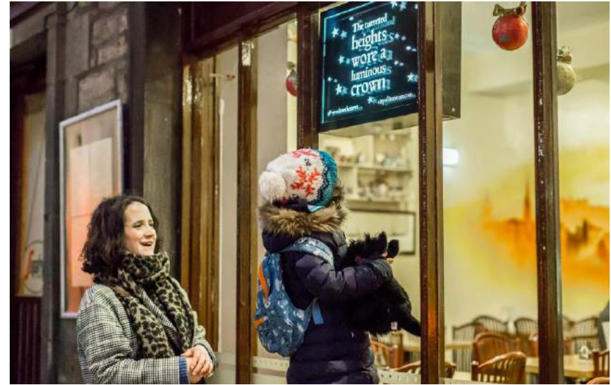
Canongate Stars and Stories literary quarter community project 2017