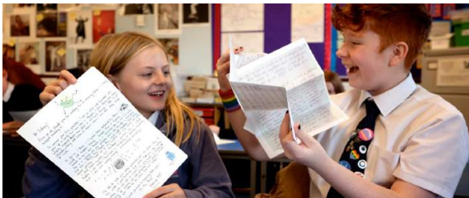
Super Power Agency School Workshop

The City of Literature Trust provides office space and is working with the Super Power Agency to support them in reaching their long-term goals: