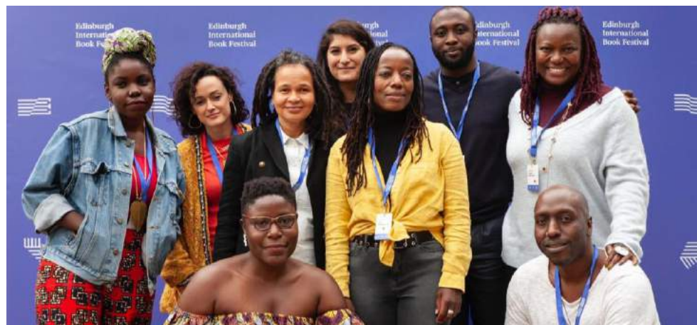
Edinburgh International Book Festival - Outriders Africa 2019

Outriders Africa: https://www.edbookfest.co.uk/the-festival/whats-on/introducing-outriders-africa