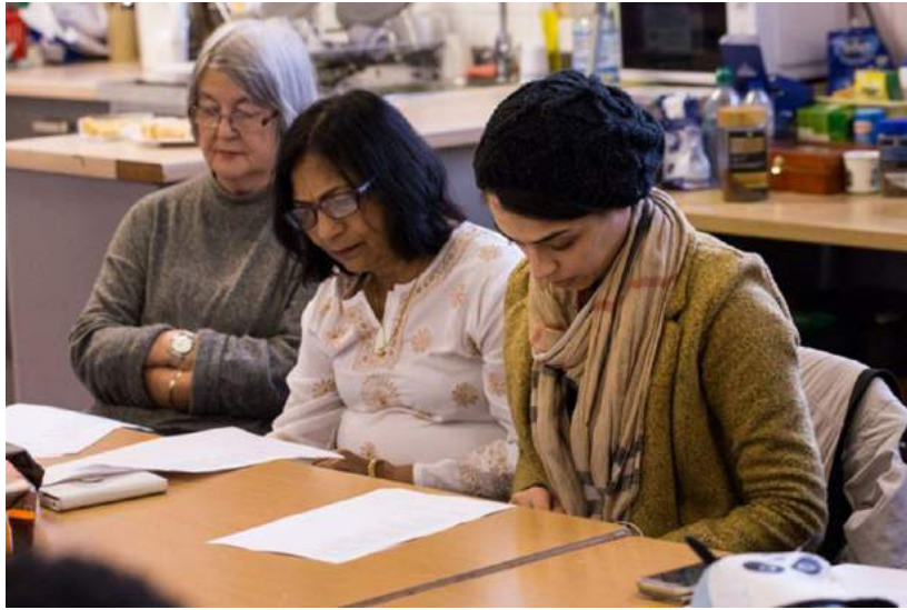
Open Book Workshop