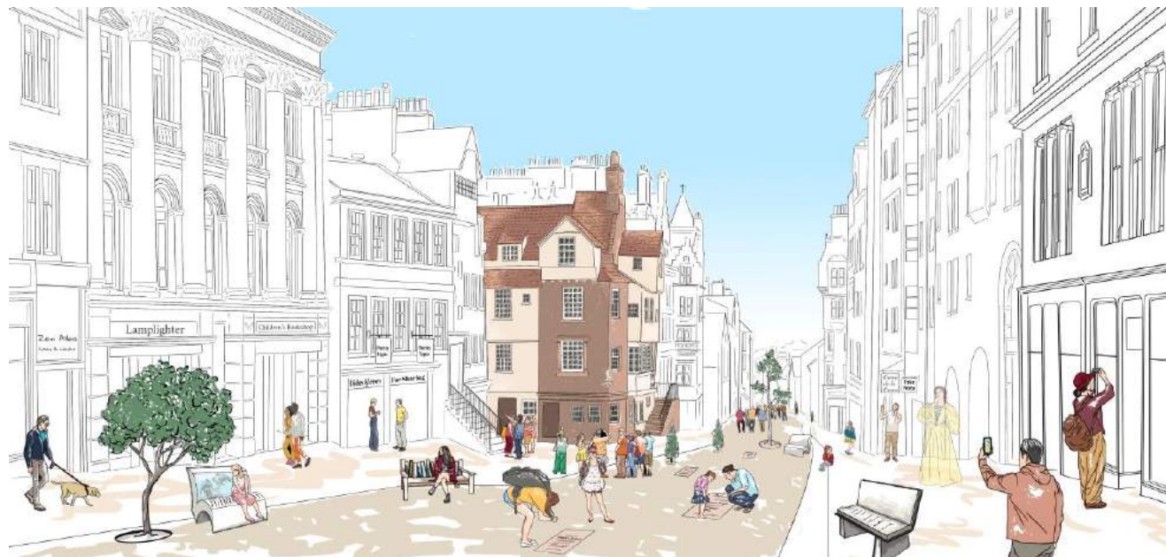
John Knox House artwork, part of the Literature House project 2020