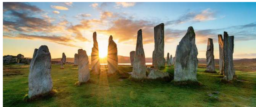
The Heart of Neolithic Orkney - UNESCO

National Values Report: https://unesco.org.uk/national-value