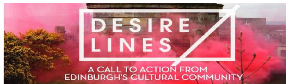
Desire Lines logo

The Desire Lines Steering Group remains active, with events and activities to champion culture and creativity in local development strategies, policies and plans.