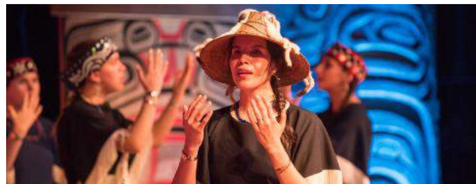
Global Storytelling Lab performance

The Global Lab is supported by funding from the PLACE Programme established by the City of Edinburgh Council and the Scottish Government. Since its inception, ticket sales average 180 each year, with 170 sold for the 2020 digital edition and attendance from 11 countries.