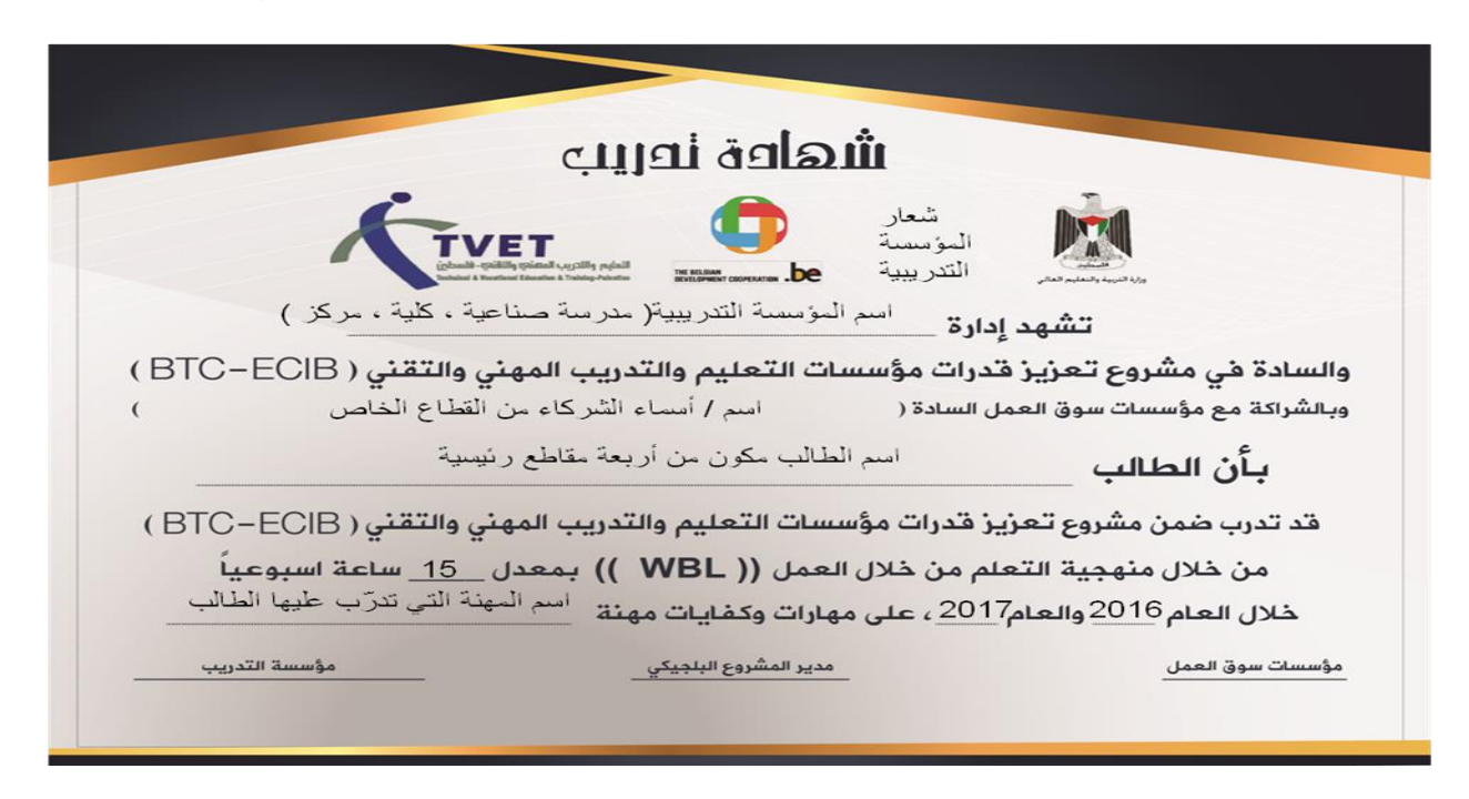
Annex 9. A template of a certificate provided under one of the BTC-funded and implemented WBL initiatives