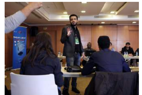
All of the activists participated in the three workshops: Media and youth (with Marwan Maalouf), Activities of youth organizations during transition (with Youssef Qahwaji) and Engagement in civic dialogue (with Sami Hourani).