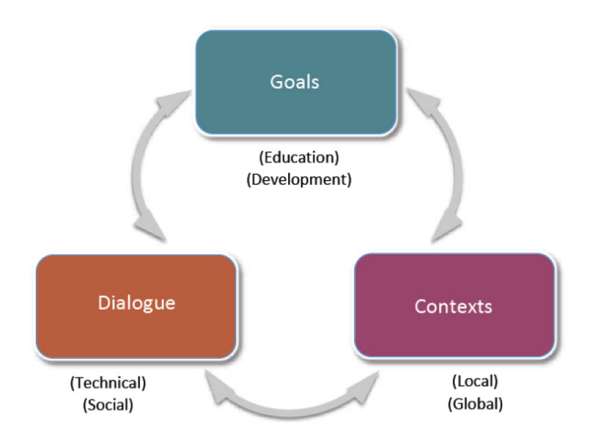
Figure 1. Triadic relationship among components of curriculum design and development processes

To achieve SDG 4 both educational goals and development aspirations must be considered in tandem. A quality curriculum can be thought of as the instrument needed to bundle these elements. In fact, many important components of education are conceptualized and operationalized via the curriculum, including the content, pedagogy, and learning contexts. The curriculum can then also be a proxy for the developmental features, such as equality, equity, inclusion, and sustainability (see for example IBE-UNESCO 2015; Amadio et al. 2015;). What follows is an elaboration of this idea. I describe the articulation of goals, continual dialogue, and contextual considerations necessary for designing and developing quality curricula. Figure 1 refers to the mutual influence between these three sets of features.