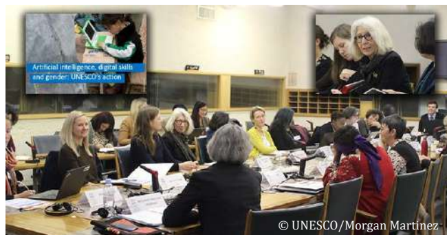
Inter-sessional Meeting of IANWGE

On 30 October, UNESCO's Division for Gender Equality hosted the Inter-sessional Meeting of the Inter-Agency Network on Women and Gender Equality (IANWGE), a network of Gender Focal Points in United Nations agencies. Representatives from different UN Agencies were present, notably from UN Women, the ILO, UNDP, UNICEF among others.