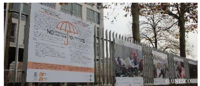
Exhibition providing facts on violence against women in the domains of competence of UNESCO.

will extend throughout the 16 Days of Activism and it may also be viewed online here .