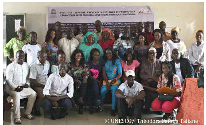
The first traveling workshop of the programme "Preventing violence and promoting gender equality through the media in Senegal" was held from 16 to 18 August 2018 in Thiès.

The traveling workshops were also held other cities, such as Kaolack (September), St. Louis (October) and Kolda (November). Promoting a culture of peace and gender equality is central to UNESCO's mission.