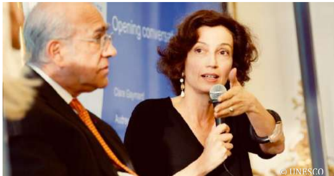
Ms Azoulay at the Women's Forum

The Women's Forum Global Meeting 2018 took place in Paris from 14 to 16 November.