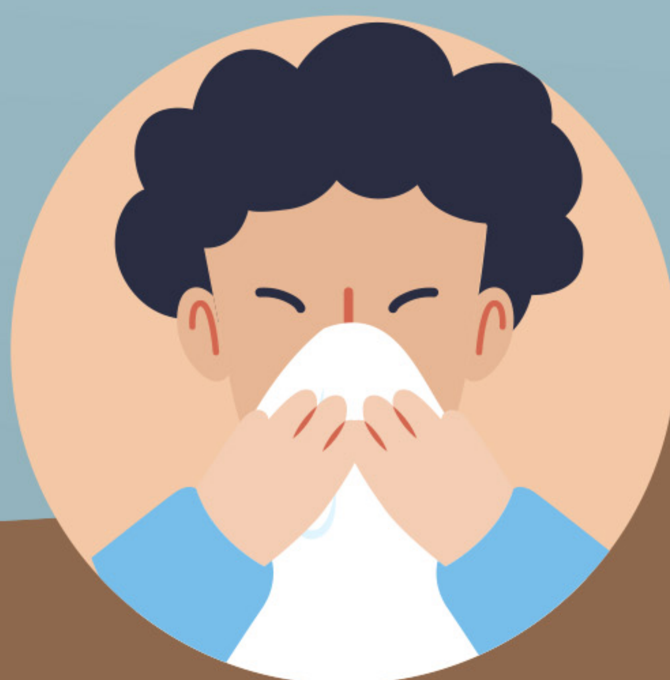
sneeze, cough properly