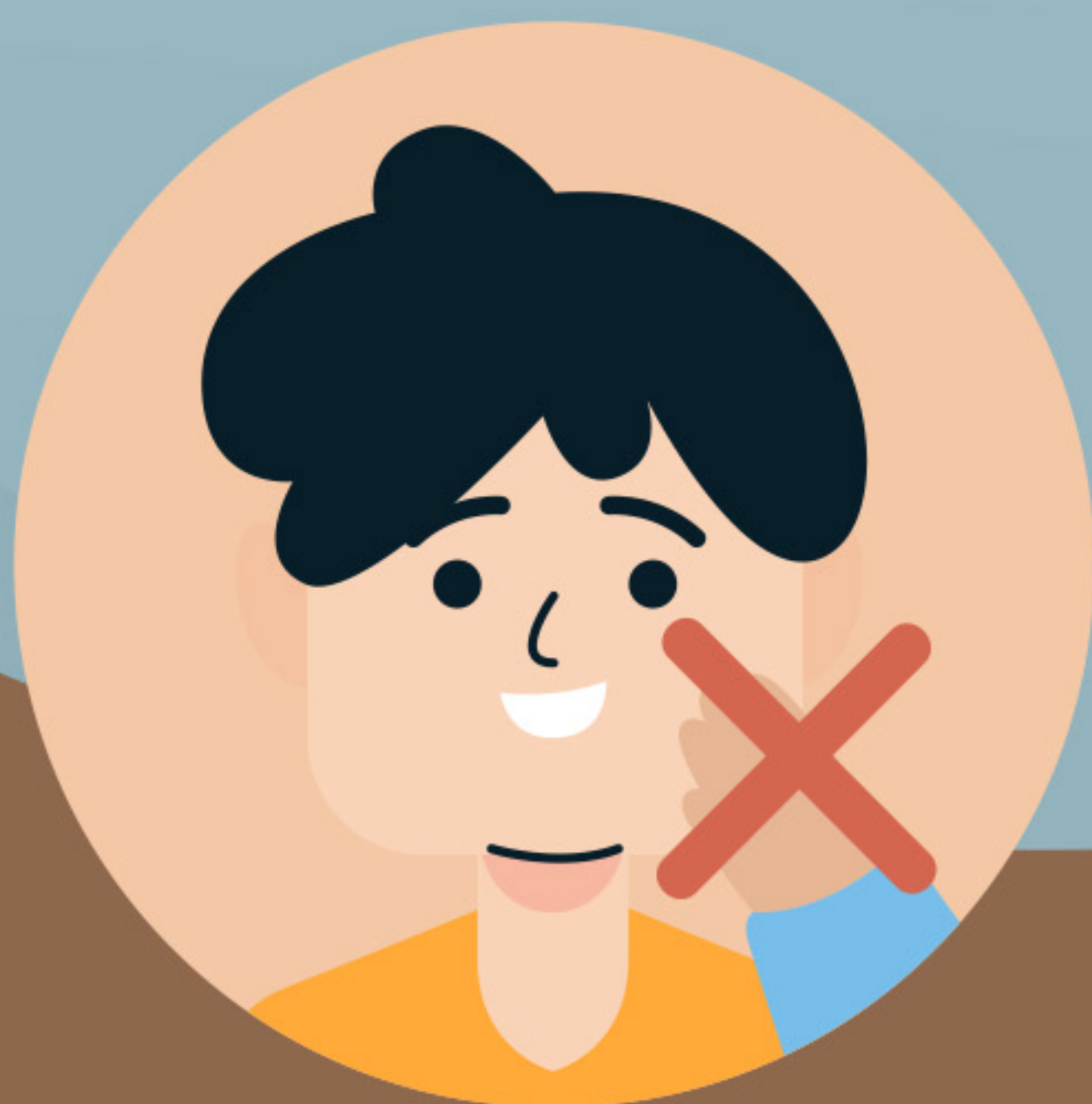
avoid touching face

Help them take control by showing specific steps they can take to fight the virus