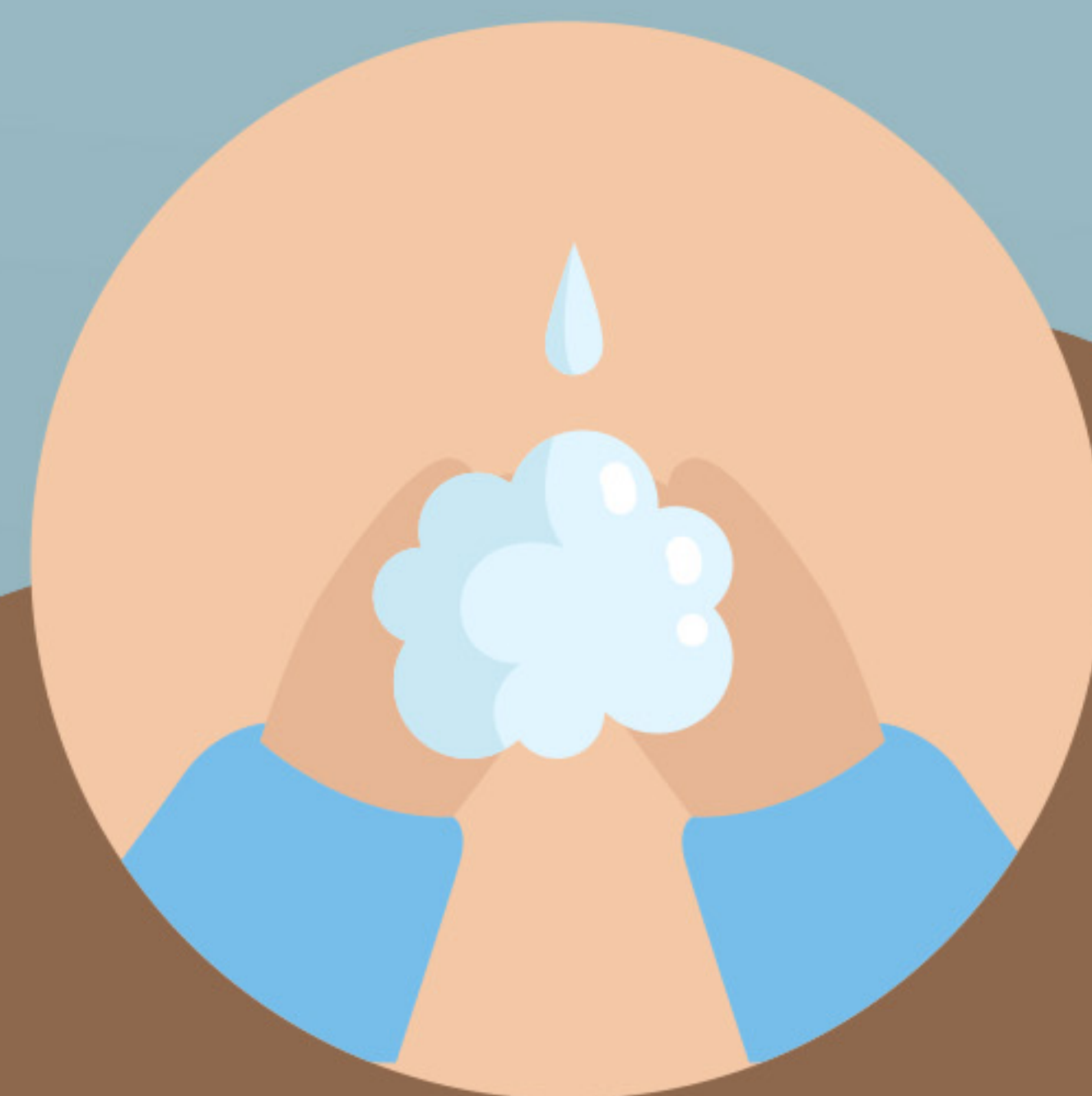
wash hands the right way

You may want to pick a song to make it easier and fun to lather their hands, e.g. humming Happy Birthday to You twice will take approximately the required 20 seconds