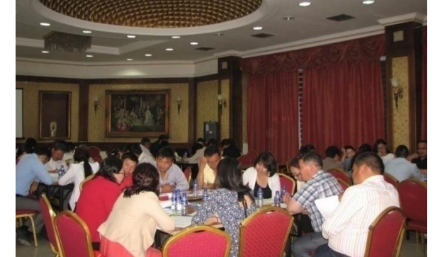
Group 3 discussion