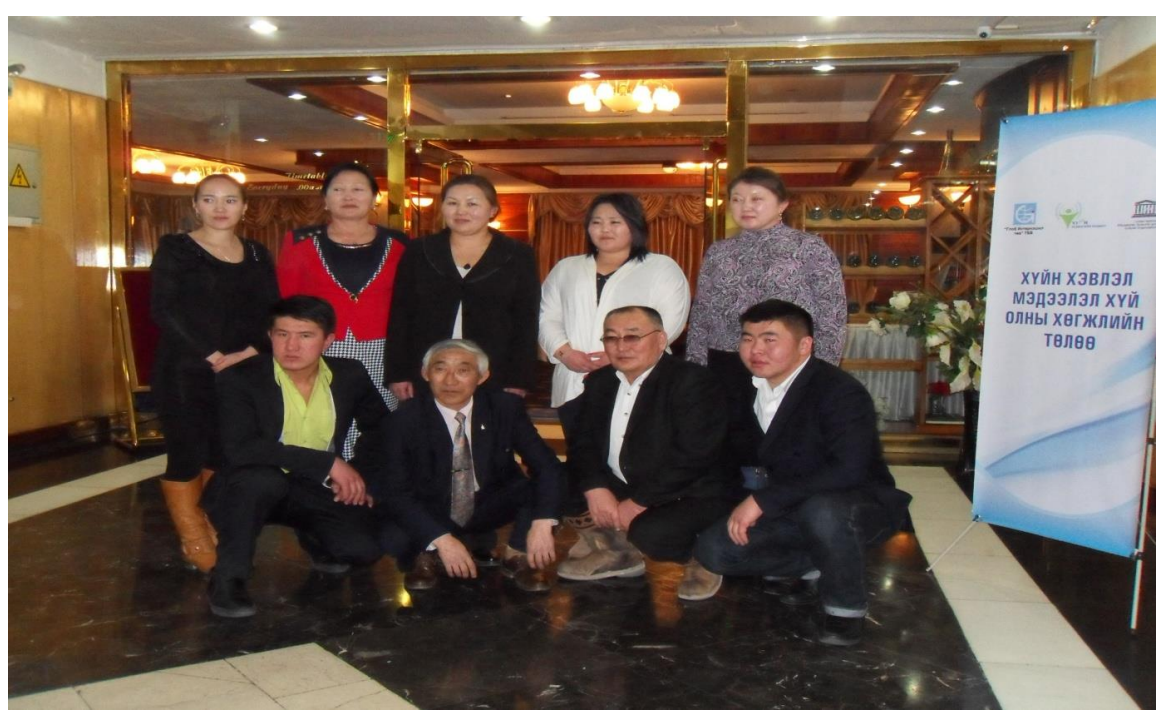
CRAMO had copied all training materials on DVD and distributed it to the community radio managers, Board members, volunteers.

Copies of soft version of training material, training agenda are available. Attachment #4.1-