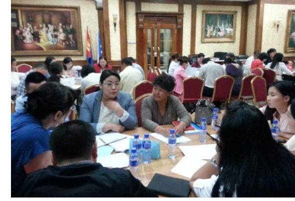
Group 1 discussion