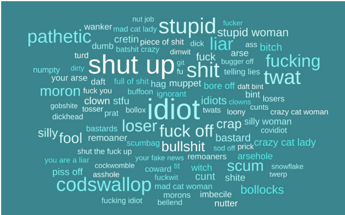
The word cloud above shows the most frequently occurring abusive terms tweeted at Carole Cadwalladr (occurring at least 20 times), normalised by case.

Next, after analysing the clearly identifiable abuse in the ‘personal’ category (55% of all abuse), we classified it into three subcategories: