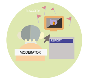
Internet intermediary companies' mechanisms