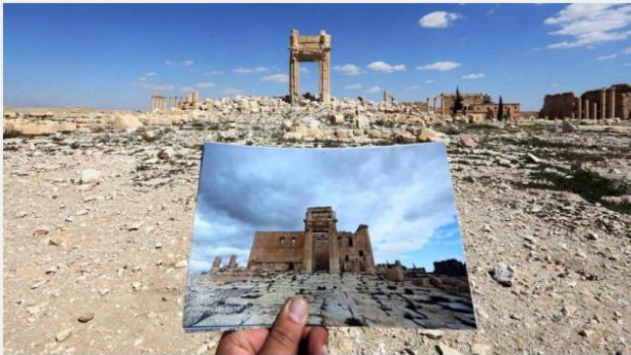
A picture showing the Temple of Bel before it was destroyed by ISIS in September 2015 in the ancient Syrian city of Palmyra. The structure dated back to 32AD