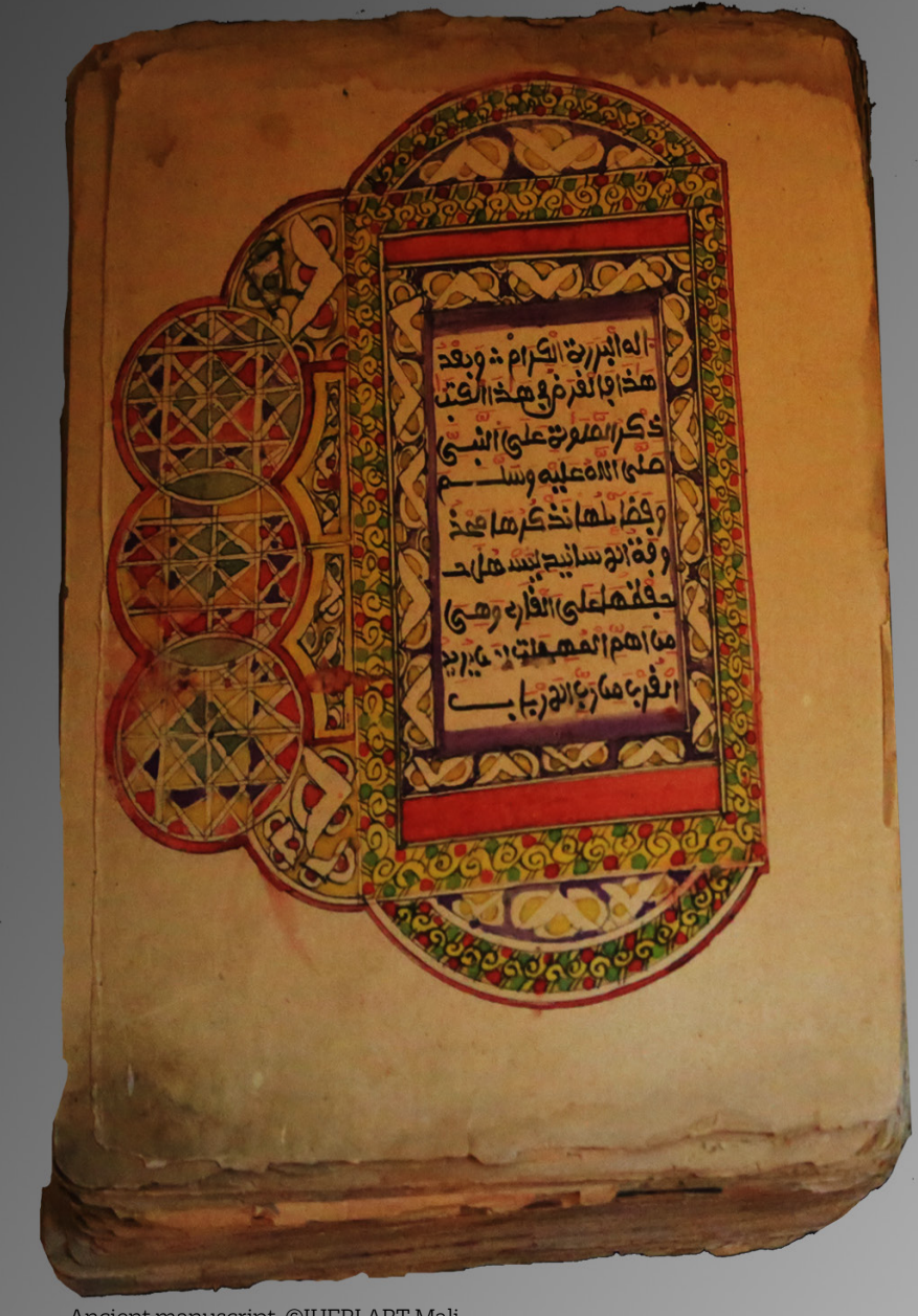
Ancient manuscript, ©IHERI-ABT Mali, photo crédit UNESCO Mali/M. Bagayoko

West Africa's Sahel has a rich movable cultural heritage that needs to be protected - ancient manuscripts, palaeontological remains, ethnographic pieces... - which can be found in museums, libraries, archaeological sites or even in communities.