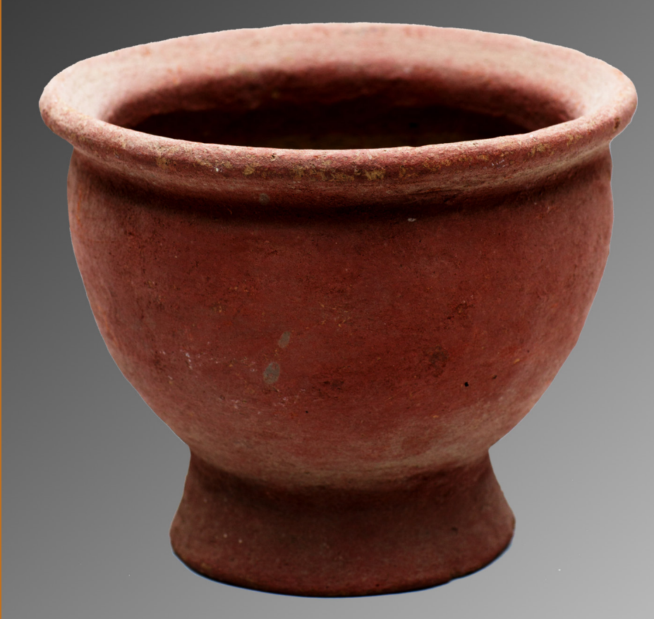
Terracotta, Benin