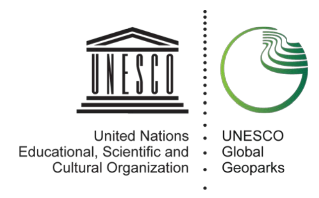
Annex 2: Added value of field inspection missions of UNESCO Global Geoparks

UNESCO Global Geoparks are unified geographical areas where sites and landscapes of international geological significance are managed with a holistic concept of protection, education, research and sustainable development. To ensure the high quality of a UNESCO Global Geopark, a procedure of field evaluation and revalidation missions using experienced evaluators was introduced which is unique among the three UNESCO site designation schemes (World Heritage, Biosphere Reserves and Global Geoparks). Given this approach, the evaluation missions are extremely important to the designation process for UNESCO Global Geoparks and the programme as a whole.