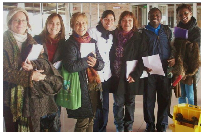
Face-to-face session, 2013 LAC Diploma

Building upon the developments and lessons learned from the 2010-2014 LAC Diplomas, the IBE will move a step forward by forging a consortium of Latin American and Caribbean universities to offer a master's in Curriculum and Learning embedded in the post-2015 educational agenda.