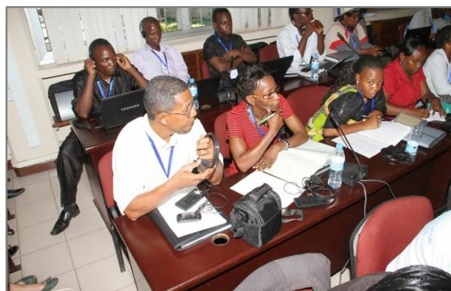
Face-to-face session, 2013 Africa Diploma