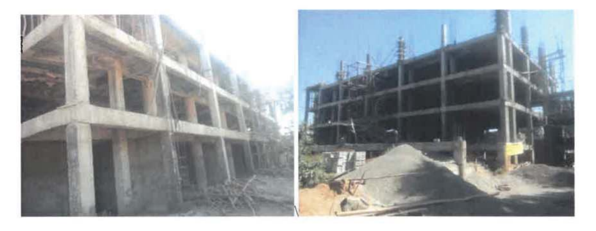
A grand Cultural Centre facility construction is ahead.