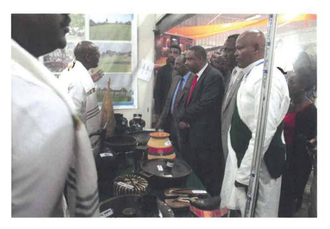
GDCA organizes exhibition to display material culture