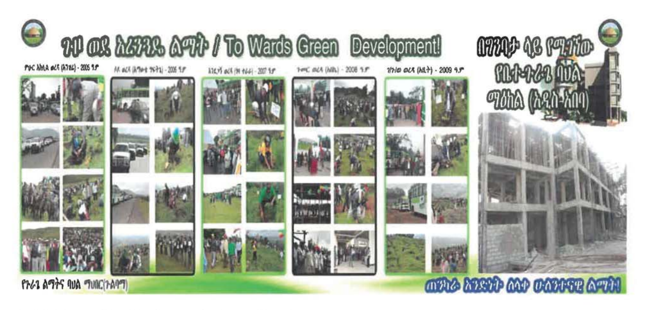
GDCA is working hard towards Green Development