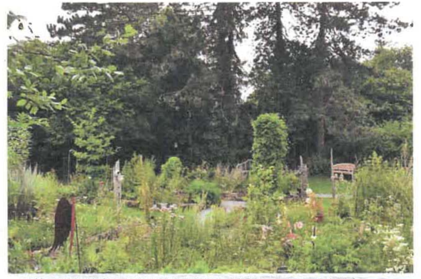
Abb.2 ANME-Förderpreis 2018 für den PhytAro Heilpflanzengarten in Dortmund.