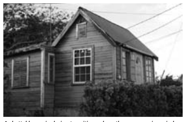
A chattel house in design transition, where there are varying window types: jalousie, sash and double-hung glass. The entrance door is also on the move.

Concrete additions housing shower, bathroom and sometimes kitchen facilities have increasingly become the norm.