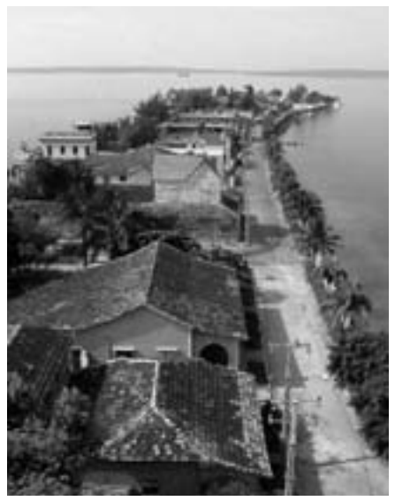
Wooden ensembles along Cuba's coastlines, Cienfuegos

Another type of wooden urban ensemble that grew up in the first decades of the twentieth century are the resort areas of Punta Gorda in Cienfuegos and Varadero in Matanzas. They are characterized by an elaboration and refinement in the design of the housing, and most of them are owned by the wealthiest classes. In both cases the settlements are located on peninsulas, with an urban plan spreading out from a street that serves as an axis along which elegant mansions are built using the balloon frame system but incorporating a great variety of formal elements. Links of this type of architecture with that in other Caribbean islands are not only formal, but also in the design of the roof and the corridors on three sides of a building or around the whole perimeter.