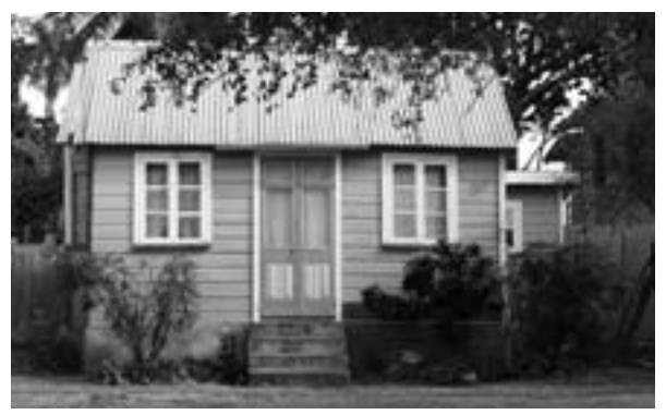
Fig.1: Typical chattel house in near-perfect symmetry

The key to the design of the chattel house is near-perfect symmetry (Fig. 1). A typical feature is that it is almost always constructed with a central door on the long side, facing the street, with a window on either side. The roof is gabled (two slopes) or hipped (four slopes). Bathroom and cooking amenities were not incorporated in the main structure during the early days of the chattel house (Fig. 2).