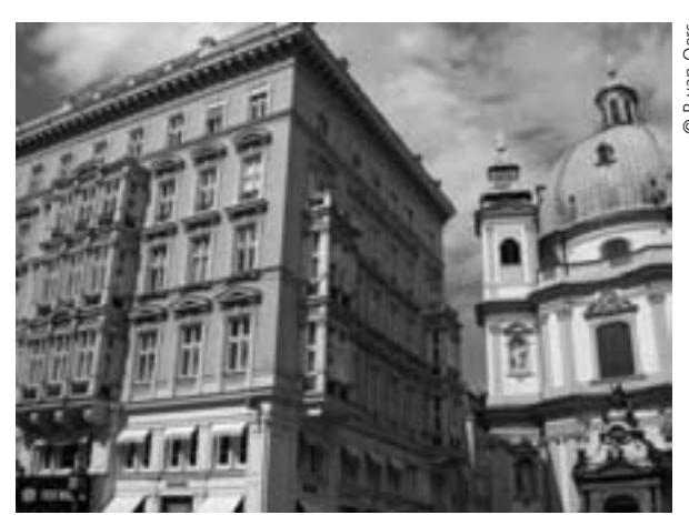
Historic Centre of Vienna, Austria (inscribed in 2001)

A fine example in this respect is the marketing of World Heritage in Austria, which has fully recognized the significance of the country's eight World Heritage sites in terms of high-quality tourism focusing on culture and natural landscapes. The main marketing objectives are to enhance the country's image and boost tourist-related revenue. The maxim reads: 'The concept of World Heritage (and of UNESCO) is a guarantee of a serious approach and high quality in the cultural domain.'