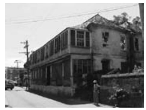
Creole Landscape, Spanish Town, Jamaica

Both Creole and Vernacular are the most significant categories of the cultural landscape of the wooden urban heritage in the Caribbean. Creole represents the distinct local spirit of the Caribbean that contains a mixture of European, African and Amerindian peoples. This landscape dominated from around the 1780s, the period of Peace Treaties and cessation of territorial wars between the European powers in the Caribbean region. It lasted until after the period of the emancipation of slavery until about the 1840s.