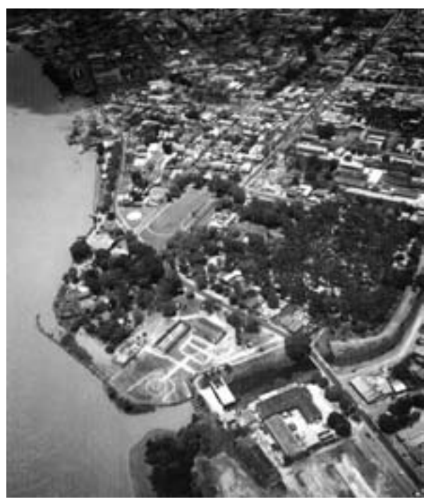
The Fort Zeelandia Complex on a protruding point on the left bank of the Suriname River with Independence Square and the historic inner city behind it

After the takeover of Suriname from the British in 1667, the Dutch built the brick Fort Zeelandia on the site of the former British wooden Fort Willoughby, on a protruding point on the left bank of the Suriname River, to guard incoming ships. Paramaribo was developed on a site where initially an indigenous village had existed, with streets containing warehouses, bars and brothels lining the harbour front. In 1683, after the colony came under the command of Suriname's first Governor and co-owner Van Sommelsdijck, the proper layout of the city was