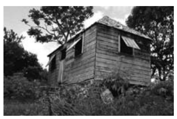
Fig. 2: Main structure of a chattel house of the early days

a roof made from wooden shingles would be entirely timber (Fig. 2).