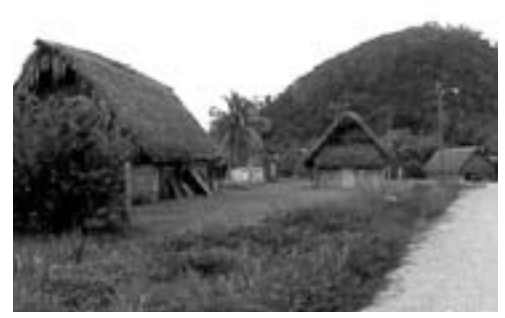
Amerindian Landscape, Belize

Aboriginal/Amerindian describes the cultural landscape of the Amerindian people prior to 1492. It is very important to note that in some rural settings this environment is still evident today, such as on the island of Dominica and in Belize.