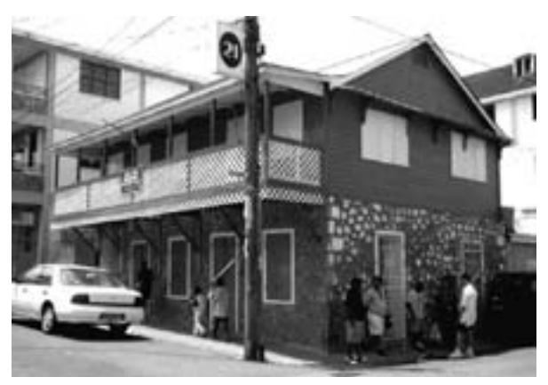
Fig.1: A 'Ti Kai' with hipped roof and small verandah

Civic and industrial buildings, many of which remain today, consisted mostly of local stone, providing cool and stable shells in which to work. Some residential buildings in town, especially the European-influenced ones, were also constructed completely of stone and some used the bricks that came in as ships' ballast. More typical in Roseau however are the small wooden 'Ti Kaz' residences (Fig. 1) and the French Creole buildings (Fig. 2). The latter consists of an upper storey in wood, encircled by a verandah, on top of a solid masonry ground floor which housed a commercial outlet for the residents above. Wooden construction used local hardwoods which have natural resistance to moisture and termites, and elastic properties protecting