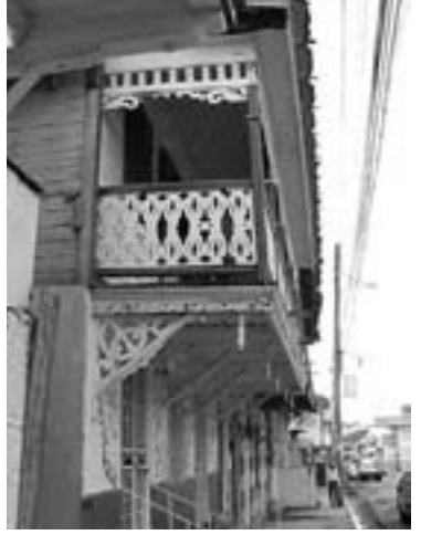
Vernacular Landscape, Roseau,

Vernacular originated from about the 1840s, after emancipation, up to the end of the First World War and into the 1920s. The vernacular is the most picturesque and ornate category of the ensembles, distinctively neither Amerindian, Colonial nor Creole, and was born as a 'new' Caribbean expression.