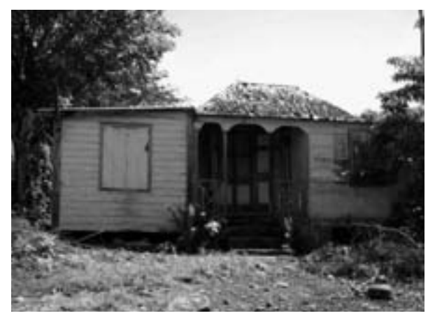
Local vernacular exuding quaintness, charm and imagination

This desire for larger homes has been fed by the introduction to the Caribbean of concrete as a building material.