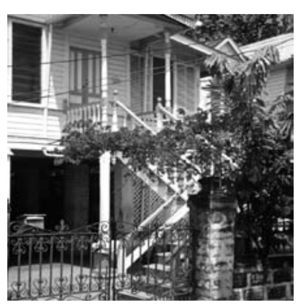
A wooden house on brick stilts, richly decorated and well-maintained, Georgetown (Guyana)

important aspect of the region's built heritage: that parallel economic development under the same colonial powers, resulting in a similar material culture including urban and architectural heritage, does not automatically mean that this cultural heritage is identical. Thorough research, documentation and analysis reveals the uniqueness, the specific characteristics and distinct differences that exist between these two similar properties.