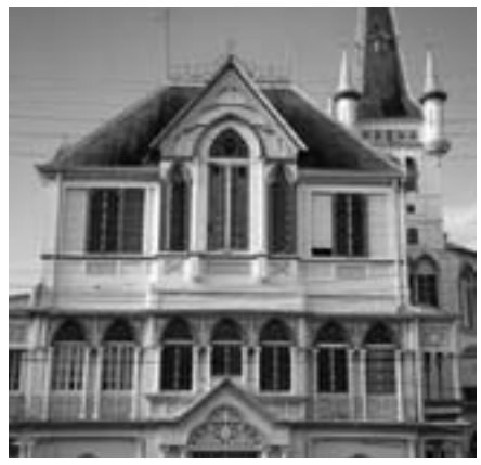
Georgetown's City Hall: an extraordinary example of Gothic architecture in a tropical context, executed in wood with cast-iron elements

rich tapestry of the Caribbean's architectural heritage is the wealth of vernacular structures, which reflect the development of the social order of the region. From simple case and 'chattel' houses, like those on Antigua and Barbados, to elaborately embellished town or country residences, like those on Haiti and Guadeloupe, true Caribbean architecture contrasts with those early buildings, which replicate traditional European styles. It is in the detail of these locally designed structures that we see how the influence of European architecture has been adapted and refined to suit the needs and climate of the tropical Caribbean'.<sup>2</sup>