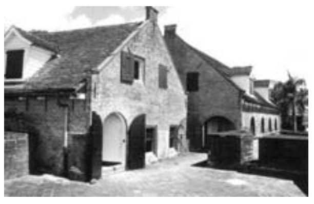
Fort Zeelandia Complex in Paramaribo (1667)

In Paramaribo the most important listed monuments are Fort Zeelandia and its surroundings (dating from 1667), the Presidential Palace (1730), the Ministry of Finance (1841), the Roman Catholic Cathedral (1885), 'Cornerhouse' (1825), De Waag (the Weigh House, 1822) and the Reformed Church (1837). Larger buildings, such as the Ministry of Finance and the Court of Justice, were designed by Dutch architects employed by the colonial government. They were built according to the existing architectural style in the Netherlands combined with local construction traditions. The wooden vernacular houses were designed and built by local craftsmen, including free blacks, and entirely reflect the Surinamese style.