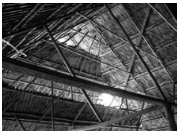
Author's work in Santa Mission, 2002

Perhaps similar to approaches advocated by ICCROM and other international conservation agencies, CAHRD recognizes that the first level of conservation is associated with knowledge. Knowledge entails documentation as a fundamental aspect for preserving cultural heritage. Architectural records aim at conserving this fragile cultural heritage as one of the major challenges of our time. Architectural records, and recording and information management in the field of conservation of indigenous works and those closely related, are continuously being developed and must be considered in the context of a system and as a fundamental part of a larger body of knowledge and disciplines converging to preserve heritage.