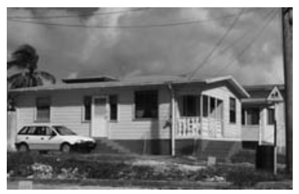
Fig. 3: Contemporary wooden bungalow, with integrated kitchen, toilet and bath

Despite the partial 'concretization' of the modern chattel house, the lingering image (usually seen on picture postcards) is one of a charming, vividly painted structure with curtains flying through windows surrounded by shutters, hoods and detailed trellis and fretwork. The chattel house has survived what I would call the 'concrete period' and has settled down for the time being as a wooden bungalow. The kitchen, toilet and bath have been totally integrated, and increased use of glass in the windows lets much more daylight into the house (Fig. 3).