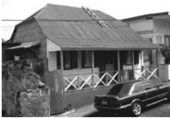
Fig. 2: A French Creole residence/commerce

them from tremors and high winds. According to Berthelot and Gaumé in Kaz Antiye (Caribbean Popular Dwelling), <sup>19</sup> Dominica's roof shapes tend to be half-hipped gables, as shown in Fig. 1, which are well braced for hurricane winds.