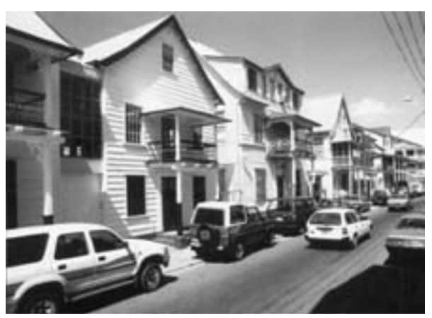
Historic streetscape in the inner city of Paramaribo

Uniformity, derived from the dominant use of timber and a strict adhesion to the prevalent style, is typical of Paramaribo architecture. The majority of wooden houses, both large and small, are similar and built after the same basic design: a rectangular layout, plain symmetrical walls, a high-pitched roof, red brick substructures as basement, with white façades and green doors and shutters. By painting the wooden walls white and the brick elements red, form rather than material was emphasized, a Dutch tradition. Extensive use of symmetry in the layout of buildings, in groundplan and façades, gives further clarity and simplicity.