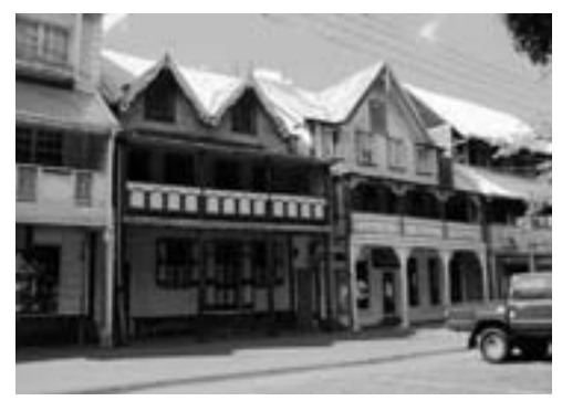
Streetscape along Brazil Street opposite Derek Walcott Square

The wooden rendition of classical structures in Soufrière was a marvel. Collectively these structures formed a streetscape flaunting their elaborately adorned eaves and banisters, overhanging balconies and jalousies all secured with intricate pegged bracing. As time passed, many events would impact on Saint Lucia's built environment. The devastating hurricane of 1780, the civil unrest in 1795 prompted by the French Revolution, the loss of cheap labour due to the complete abolition of slavery in 1838, and the fire of 1955 resulted in a close to barren architectural heritage resource.