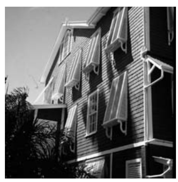
Demerara windows of the Red House, Georgetown (Guyana)

Georgetown, on the other hand, as a primarily British colonial ensemble, is characterized by the remarkable combination of architectural styles, which are mostly nineteenth-century European in origin, such as Gothic, semi-Tudor, Romanesque or Italian Renaissance. Exceptionally, all have been executed in wood, always easily available and as a light material well-suited to the load-bearing capacity of the clay soils. Even within the vast British colonial empire this unique aspect is virtually unmatched: 'Georgetown ... home to some of the most exuberant Victorian architecture in tropical and subtropical climes'.17 The wood used during British colonial times was a mixture of hardy local greenheart and pine imported from North America, which came as ballast in the ships that transported the famous Demerara sugar. The buildings, which also reflect major influences from the West Indies in response to the particular climatic conditions in Guyana, refine Georgetown's distinctive character: the architectural heritage is a blend of styles and a true example of 'mutual heritage'.