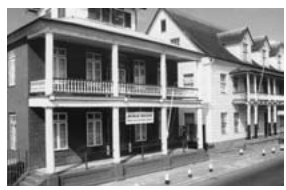
A section of Gravenstraat in the heart of historic Paramaribo (Suriname) that was destroyed by fire some months after this photo was taken in 1996

For the implementation of this activity a co-operation was established with CARIMOS, which was created in 1982 as a ten-year project by the Organization of American States (OAS) and transformed into a regional non-profit organization in 1994. Pursuing its initial goal to identify and study the historic monuments of the Caribbean region, CARIMOS has contributed to training activities, published the findings of its research