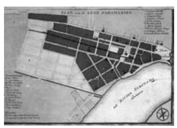
Plan of the City of Paramaribo (c. 1700) Dutch General State Archives, The Hague

The inner city of Paramaribo, the part which is now inscribed on the World Heritage List, was laid out behind Fort Zeelandia surrounding a military parade ground, currently named Onafhankelijksheidsplein (Independence Square). Next to being a parade ground, this square provided for an open field of fire in front of Fort Zeelandia, a common strategic feature in colonial city planning. The city was laid out westwards on shell ridges, which are remnants of ancient times when the ocean reached this far inland. These ridges consisted of stable soil with natural drainage and made good construction sites. From the mideighteenth century the city was extended southwards on the sandy banks of the river. By constructing canals with sluices and canalizing existing creeks, the wider area around Paramaribo was drained to keep the city dry and make more land available for construction. In between these canals the land was subdivided into regular and standardized plots according to egalitarian principles. All this resulted in a rational town plan, which followed the natural lines of ridges and creeks and the curves of the