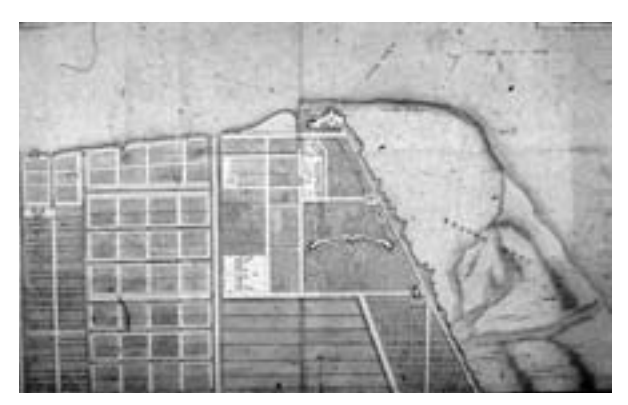
Plan of Georgetown (1798)

The conversion of the low-lying, fertile clay banks surrounding the Demerara River into plantations required large civil engineering structures, consisting of canals running perpendicular to the river and high dams (back and front) parallel to the river. The canals were used to drain the water surplus of the hinterland into the river through sluices, which were opened during low tide. The frontdam or dyke supported a road connecting the different plantations. This system of canals, sluices and connecting damroad defined the urban layout of Georgetown and they are still essential visual characteristics of the city. Georgetown's most important streets, High Street in Kingston, Main Street in Cummingsburg and Avenue of the Republic, originate from the ancient connecting damroad.