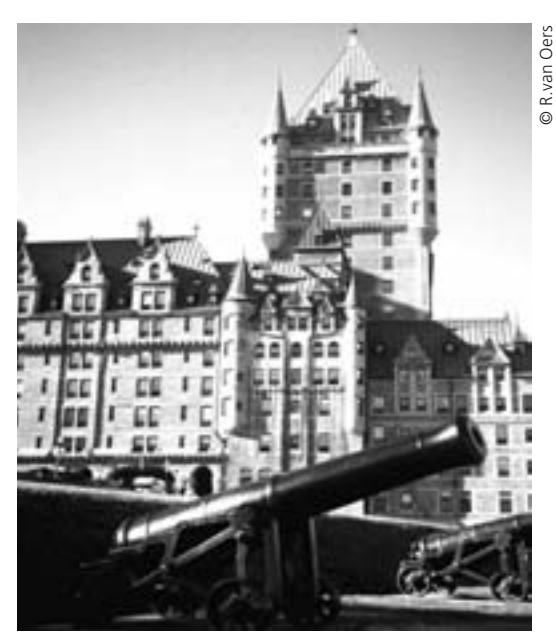
Historic District of Québec, Canada (inscribed in 1985)

Second, nature and heritage tourism are a significant and rapidly growing segment of the sector. Exact statistics of the size of the market do not exist. However, United States tour operators report that each year 4 to 6 million people travel from the US overseas for nature-related trips. Nature and heritage tourism will add to the tropical beach leisure vacation in the Caribbean to provide for balance and variety to the tourist stay.