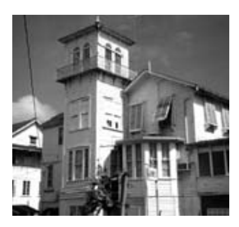
Georgetown's vernacular wooden architecture

The expert meeting attempted to differentiate between wooden architectural heritage, comprising various architectural expressions in wood including standalone grand monuments in rural areas, and wooden urban heritage: the focus was on the vernacular architecture clustered in urban ensembles of sufficient size.