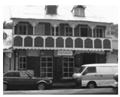
Typical townhouse in Soufrière (Saint Lucia)

Two urban areas noted for their structures are Soufrière on the south-west coast and the capital Castries, on the north-west coast. Soufrière was the first seat of colonization for the French in 1744. Applying the concept of the urban grid with an open space as the major focal point, settlement took root. The many low-rise wooden town houses along the narrow streets complemented the public square, collectively promoting a qualitative and aesthetic dimension of living. These town houses, belonging to estate owners in the outer districts, were typically similar in function. The ground or parlour floor was reserved for commercial use with the living spaces on the upper floors. Also typical of these structures were their basic design concept and proportion, with generous balconies supported by wooden columns forming a natural portico that sheltered patrons along the sidewalk.