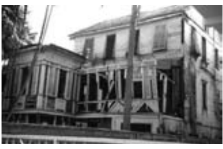
Chess Hall in Georgetown (Guyana): situation in 2002, it collapsed soon after and has disappeared from Georgetown's historic streetscape

wooden heritage still present in the Caribbean region and exchange information on issues of protection and conservation. Furthermore, part of the meeting aimed at debating the role of this heritage in strengthening cultural identity, both of individual islands and the Caribbean region as a whole, and what opportunities exist in terms of sustainable development, in particular for tourism.