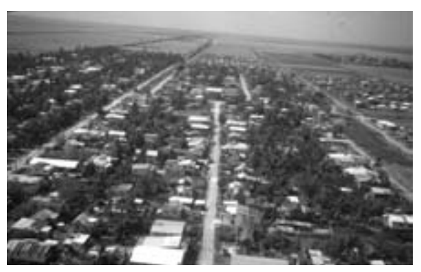
The outskirts of Georgetown, where former plantations are being converted into urban neighbourhoods

Georgetown is a typical planned city: no indigenous settlement existed at the mouth of the Demerara River before the decision was made to found a settlement, a strip of land for public functions was reserved and a town plan prepared. The flat, clayish and fertile lowlands at the mouth of the river were divided into numerous rectangular plantations, separated by dams and drainage canals