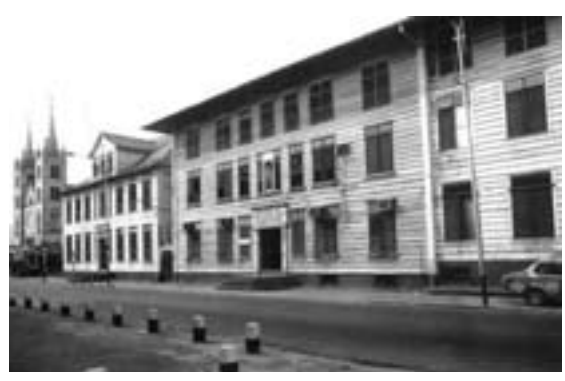
Gravenstraat in Paramaribo (Suriname) with its Cathedral: a fine urban ensemble in wood

The Thematic Expert Meeting on Wooden Urban Heritage in the Caribbean Region was organized by the UNESCO World Heritage Centre in co-operation with the Government of Guyana, the UNESCO Office for the Caribbean in Jamaica and the Organization of the Wider Caribbean on Monuments and Sites (CARIMOS), with financial support from the Netherlands Funds-in-Trust at UNESCO, in February 2003 at Georgetown (Guyana). It was part of a series of thematic studies and related expert meetings involving the Caribbean region, initiated under the Global Strategy Action Plan of the World Heritage Centre, aiming to facilitate the identification, protection, conservation and nomination of specific categories of heritage pertinent to the Caribbean region - in this case the particular type of vernacular wooden architecture as part of larger urban ensembles.